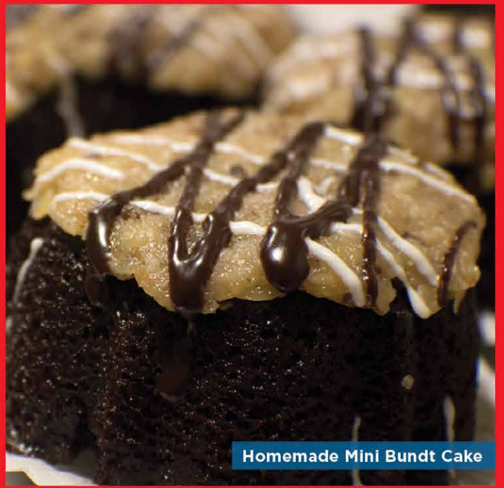
Homemade Mini Bundt Cake