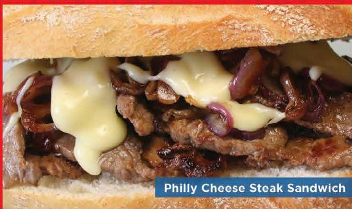
Philly Cheese Steak Sandwich

Smash Burger* ..... 13.99 Our custom blended 8oz. beef with bacon and onions, smashed with American cheese on a potato bun, served with lettuce, tomatoes and onions.