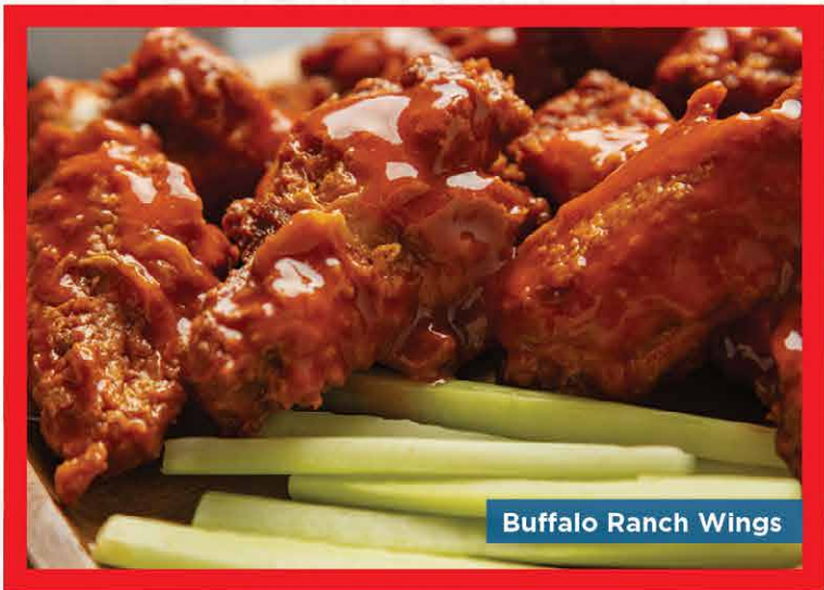
Buffalo Ranch Wings