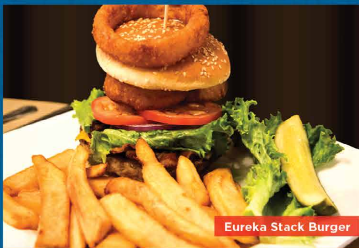
Eureka Stack Burger