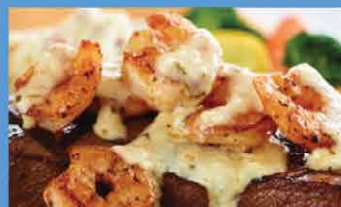
Steak & Shrimp Scampi 16.99