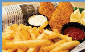
Walleye Wednesday 11.99