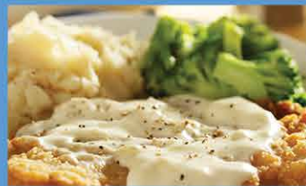
Country Fried Steak 11.99