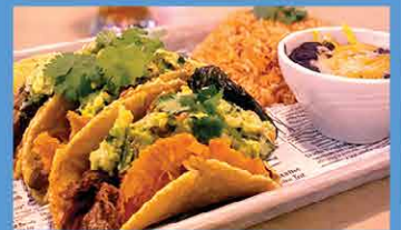
Taco Tuesdays 9.99