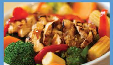
Chicken Teriyaki Bowl 9.99