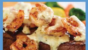
Steak & Shrimp Scampi 16.99