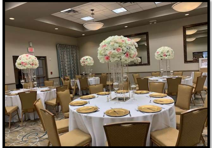
Crystal Sands Ballroom