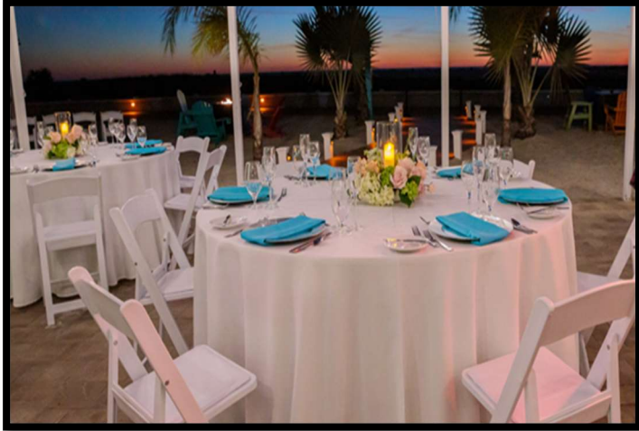
Waves Venue (Beach front)