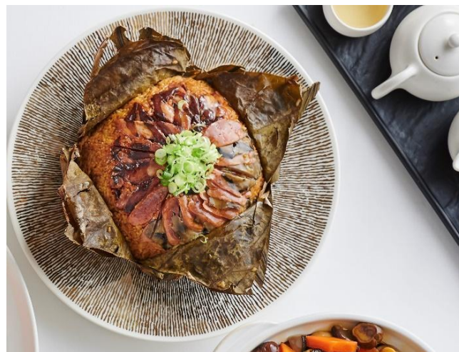
Fragrant Fried Rice Wrapped with Preserved Meat wrapped in Lotus Leaf

To mark the year of the dragon – known as one of the supreme animals out of all twelve Chinese zodiacs, York Hotel Singapore unveils an attractive array of auspicious treats for sharing good fortune and blessings. From White Rose Café's Lunar New Year takeaway menu , our 'Abundance of Wealth' Celebratory Bundle (S$268 net, serves 4 to 5 persons) comprises popular treats such as Prosperity Lo Hei with Smoked Nordic Salmon and Mini Abalone (large); Eight Treasures Chicken; 'Fa Cai Luo Han Zhai', Fragrant Fried Rice with Preserved Meat wrapped in Lotus Leaf , and Traditional Yam Paste with Pumpkin and Gingko Nuts .