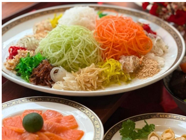
Prosperity Lo Hei with Smoked Nordic Salmon and Mini Abalone