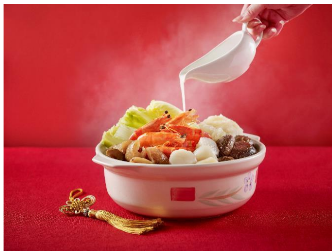
Golden Treasure Seafood Pot

Singapore, 1 December 2023 – York Hotel Singapore is excited to welcome the Lunar New Year of the Dragon with a delightful array of new and time-honoured creations, perfect for the season of happy reunions. Elevate the celebration to a high note by gathering the family for a decadent Reunion Buffet Dinner (9 February 2024) at White Rose Café where the buffet spread boasts mouth-watering delights that are beyond delicious. In the spirit of gifting, multiply the joy of the celebratory season by sending delectable festive delicacies from our online takeaway menu (25 January to 24 February 2024) along with heartfelt wishes to cherished friends and esteemed business associates.