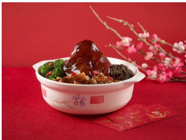
Braised Pork Knuckle with Sea Cucumber, Black Moss and Broccoli