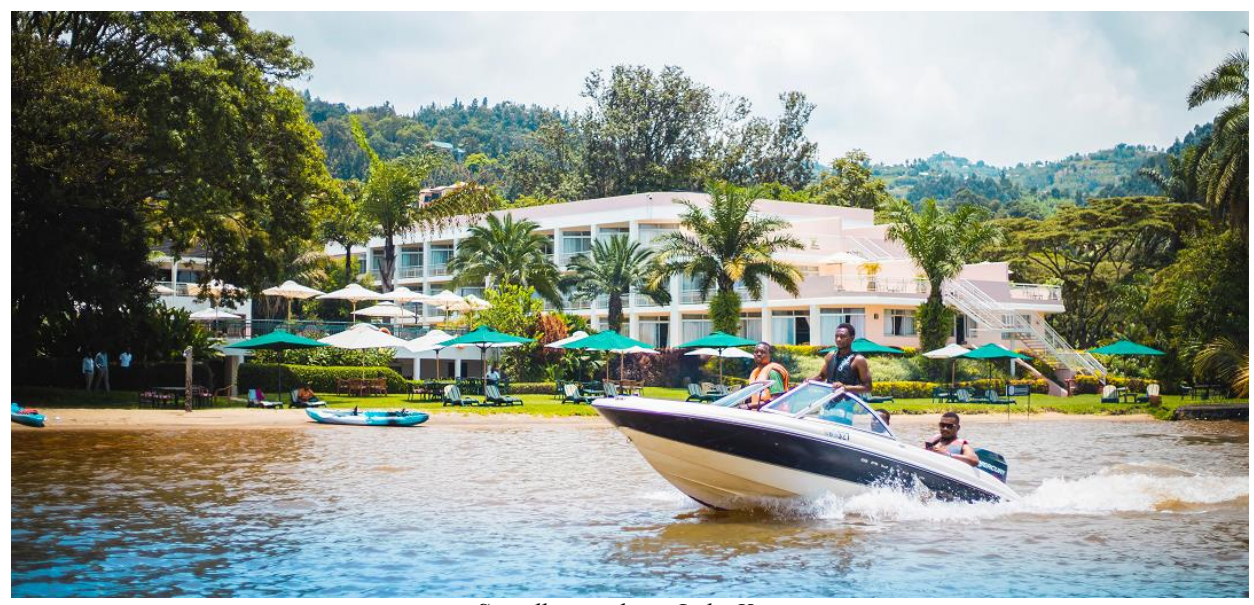
Speedboat ride on Lake Kivu