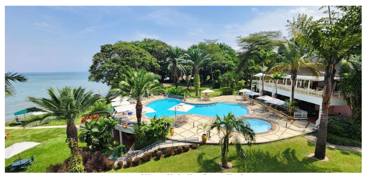
Aerial View of Lake Kivu Serena Hotel

https://issuu.com/landmarine/docs/inzozi_9_june-aug-24 - Page 56 to 59