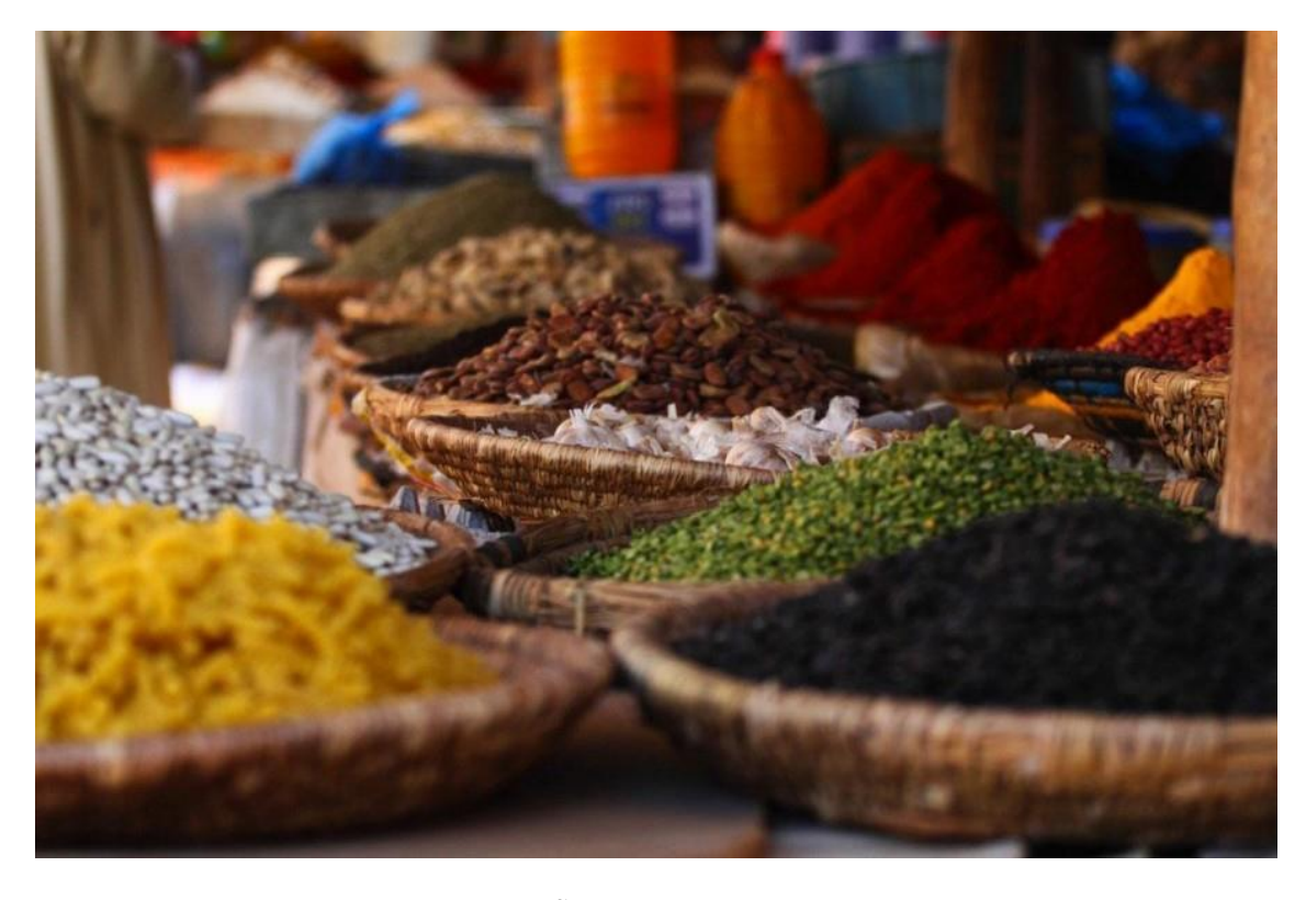
Spice Farm Tours