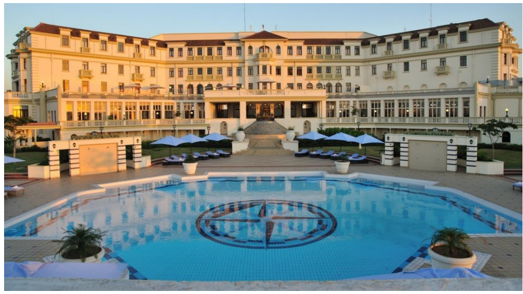
Polana Serena Hotel

immerse yourself in a different adventure including a stay at Maputo's premier 5-star address – the Polana Serena Hotel, aptly described as the Grand Dame of African Hotels.