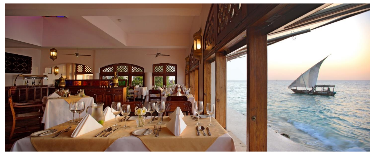
The view from Baharia Restaurant at Zanzibar Serena Hotel

The packages with Jambo Jet will give travelers opportunity to explore Stone Town with its winding lanes, minarets, carved doorways and landmarks including the Freddie Mercury Museum, visit the spice farms and enjoy fine seafood and other culinary delights at Zanzibar Serena Hotel's Baharia Restaurant whilst watching dhows and boats sail by.