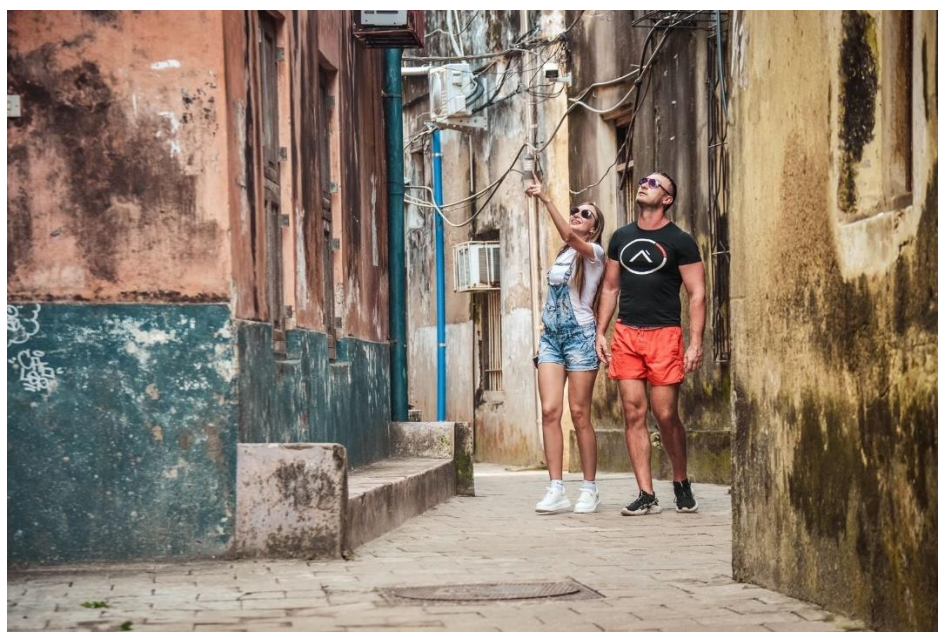
Stone Town Visit

Stone Town, where Zanzibar Serena Hotel is located is in the main island of Zanzibar or Unguja, the traditional name, has maintained its historic look and feel with Arabic and Swahili influences.