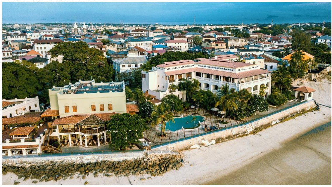
Aerial view of Zanzibar Serena Hotel

Jambo Jet launched its Nairobi - Mombasa - Zanzibar flight on 1<sup>st</sup> July, opening new possibilities for both local and international travelers to experience the enticing delights of the archipelago that is off the coast of East Africa.