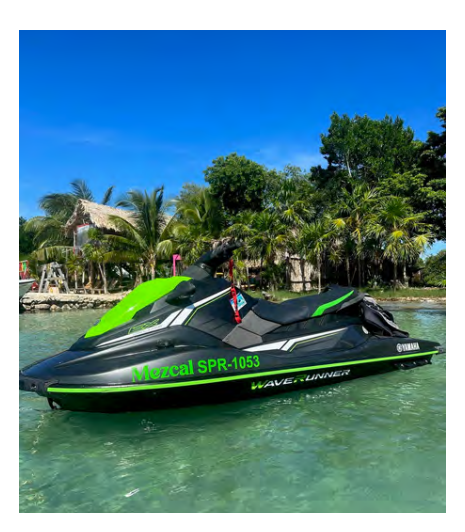
Our one hour Jet Ski rental is priced at $200 US per Jet Ski for single or double riders.