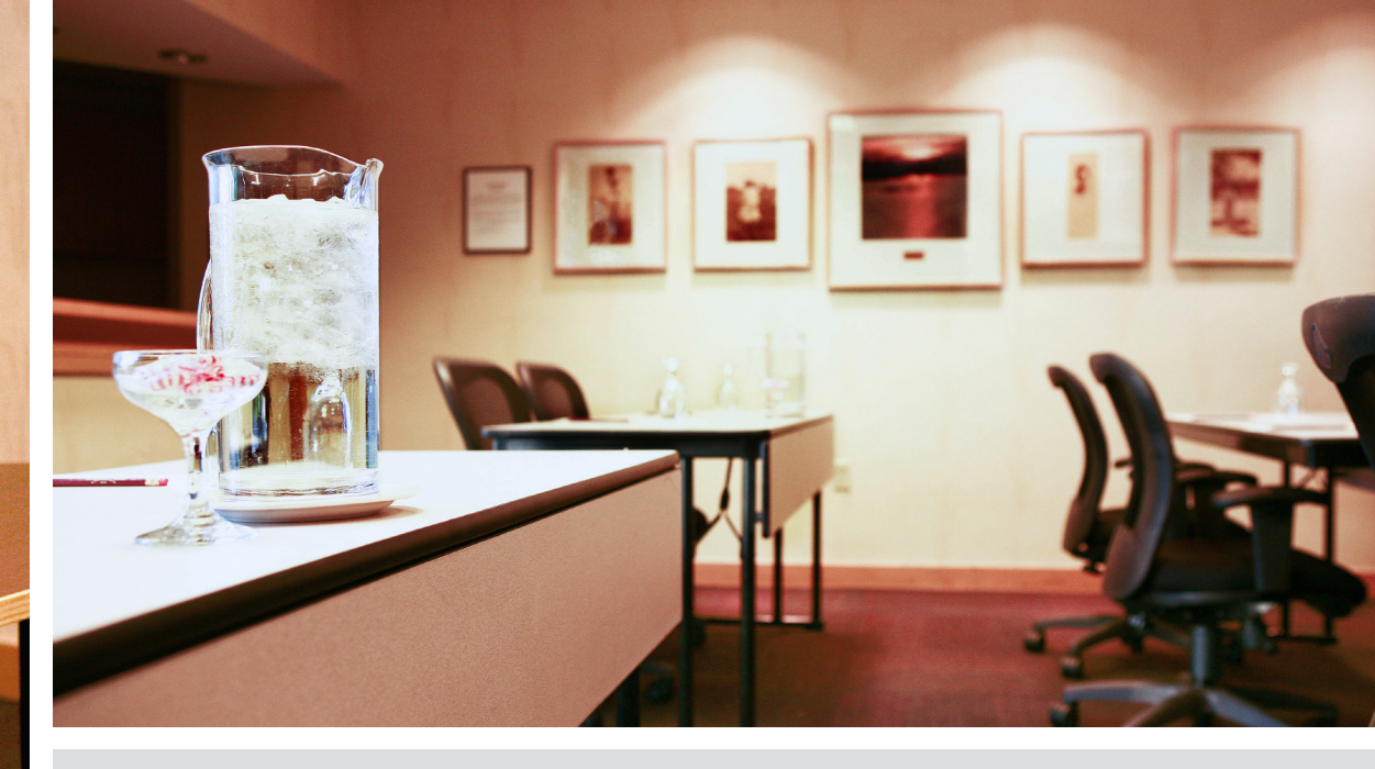
Plan your next conference at Gateway Hotel & Conference Center