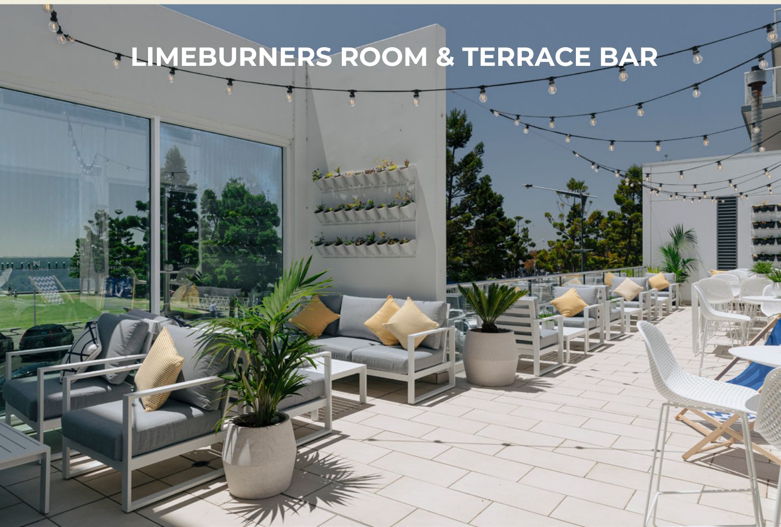
LIMEBURNERS ROOM & TERRACE BAR