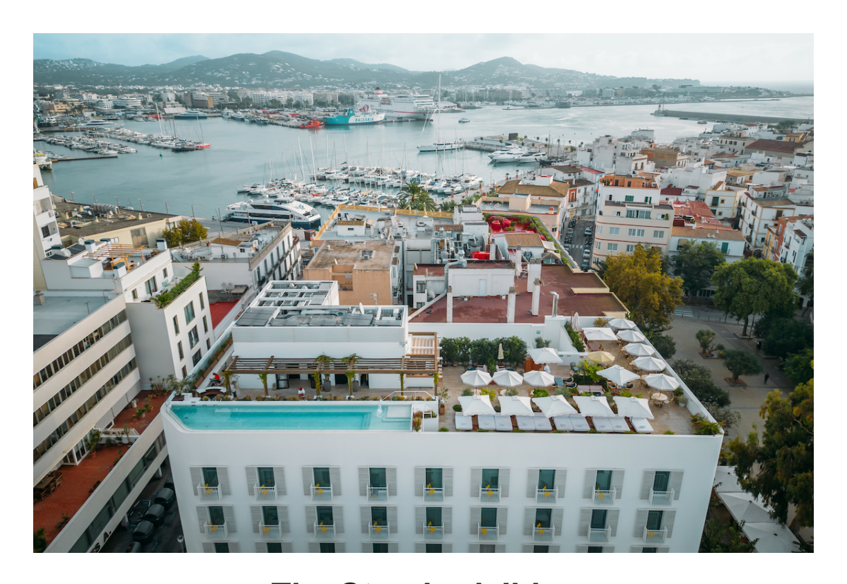
The Standard, Ibiza