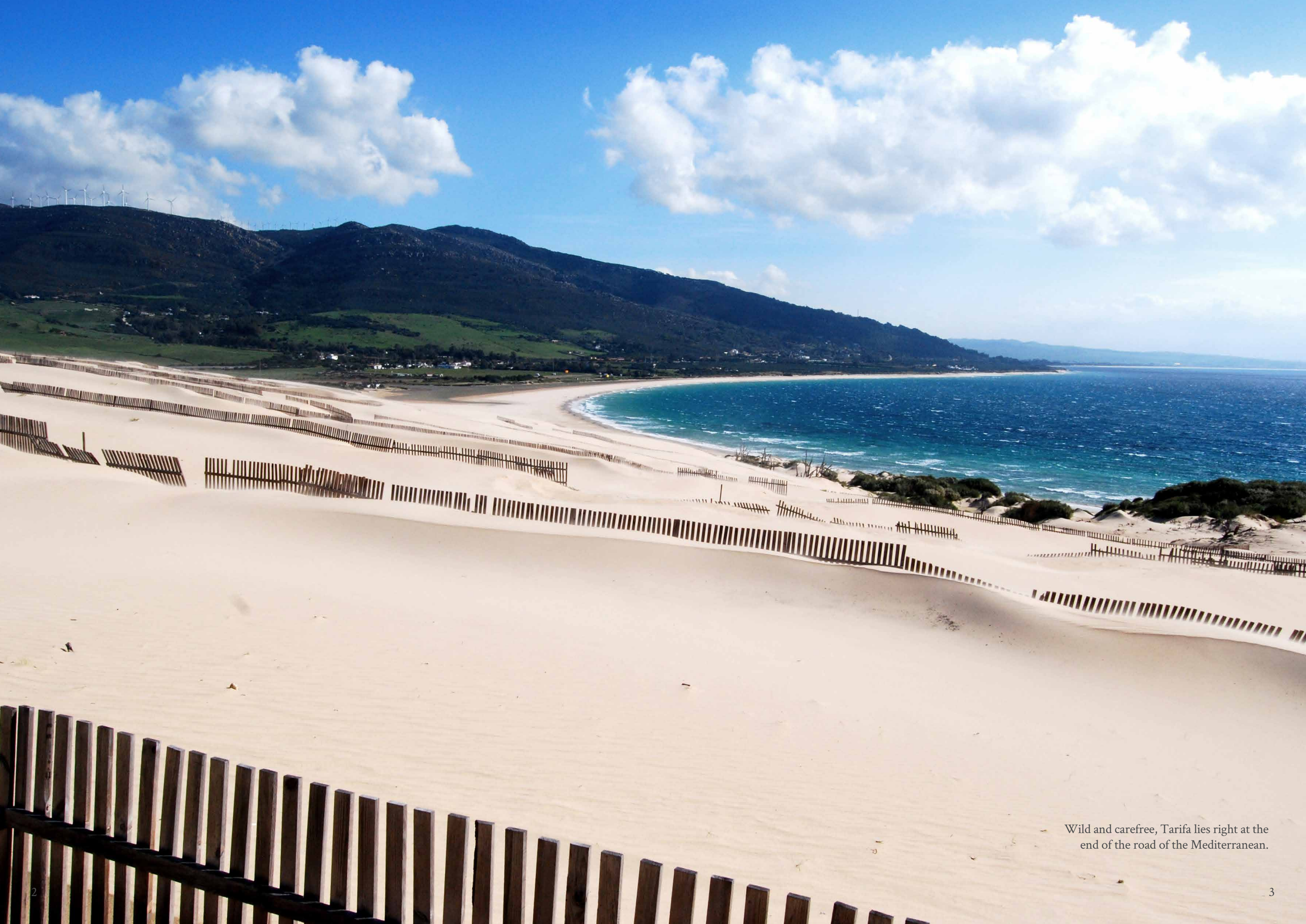
Wild and carefree, Tarifa lies right at the end of the road of the Mediterranean.