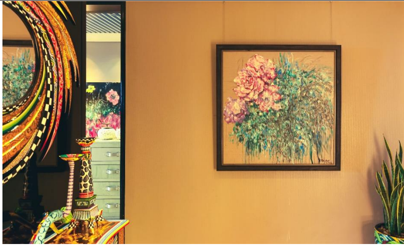
'Like Smoke' Art work in Champs-Élysées Suite Entrance

The 224-square-meter Champs-Élysées Lagoon Suite has been uplifted into a "paradise" created by Artist Hua Qing, while the 124-square-meter private terrace is an even more splendid interpretation of "paradise" with the private lagoon and the tropical plants, which will make the viewers wonder whether they are in the exhibition site or in the spiritual world of the artist.