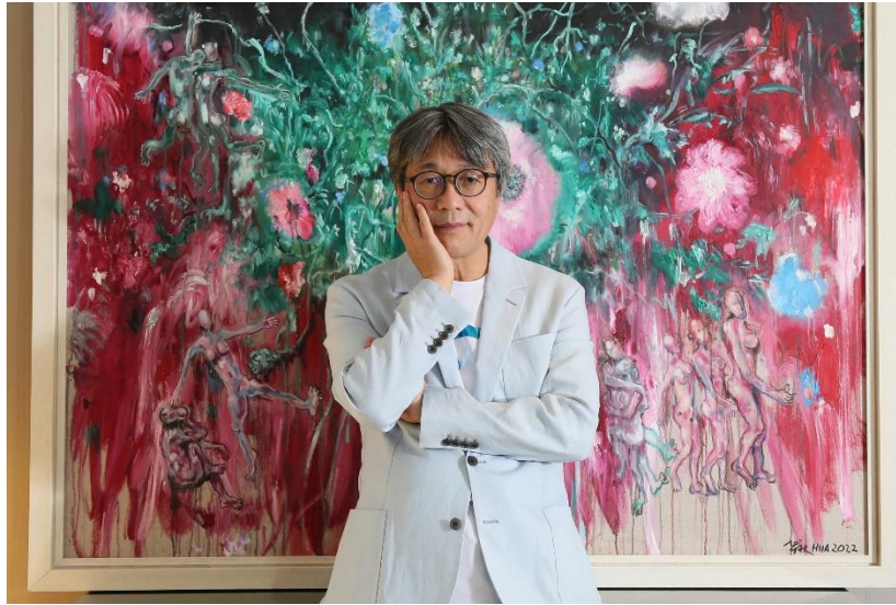
Artworks from the Natural Paradise Art Exhibition with Artist Hua Qing

Through this art exhibition, Hotel Éclat Beijing intends to invite guests to experience the artistic expression of the artist's attribution to Nature and Life. When entering the 19th floor corridor, the viewers will embark on a journey stepping into an art gallery in Paris. The fascinating artworks extend all the way to the Champs-Élysées Lagoon Suite.