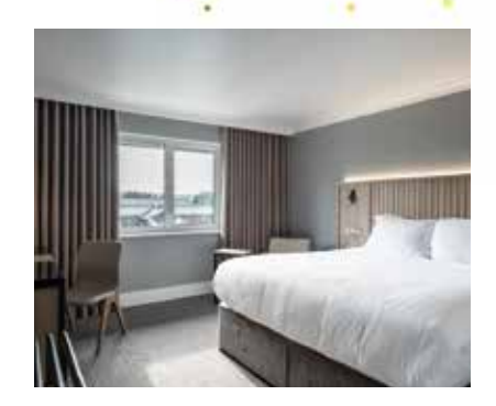
CELEBRATE & STAY

Extend your celebration and take the lift home. Enjoy 15% off our best available room only & bed & breakfast rates.