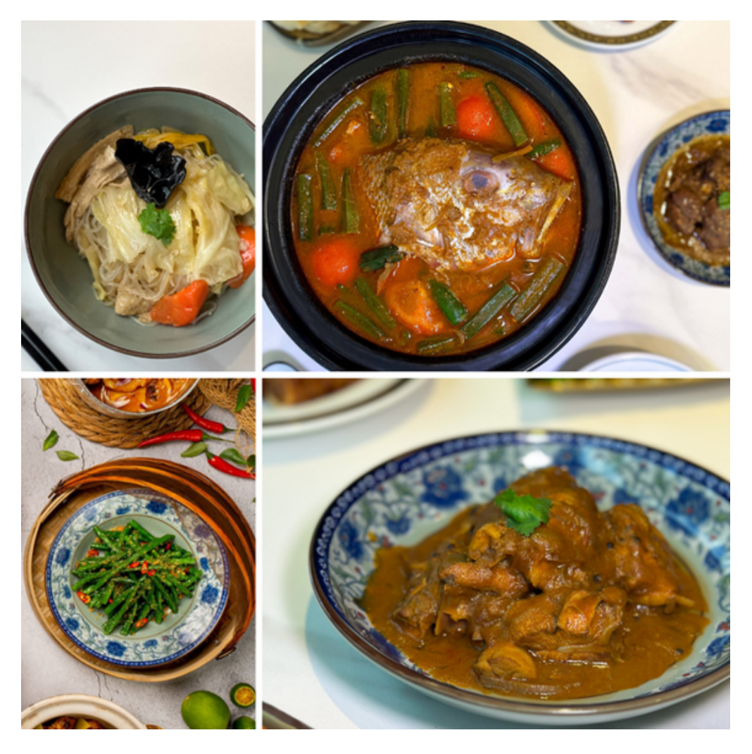
'TREASURED FLAVOURS OF SINGAPORE' TAKEAWAY SETS

Savour some of our delightful dishes from the 'Treasured Flavours of Singapore' menu.