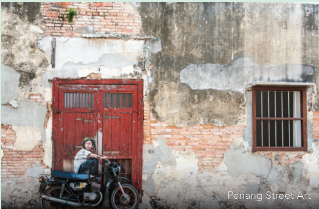
Penang Street Art