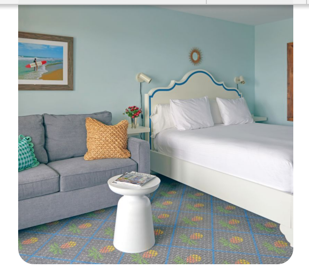
Beach Shack Cape May, New Jersey

Steps from Cape May's award-winning Cove Beach, the aptly named Beach Shack has been a coastal-cool hotspot for over 50 years. The vibe is welcoming and chill—four-legged friends and little ones are encouraged, sand in the sheets is no big deal, and the most important part of your stay is how much you enjoy it. Pack your bag for a day on the sand, take a stroll through the historic Downtown area, or find an orange-and-blue umbrella to call your own and lay out by the hotel's pool. Grab a refreshing cocktail at the pool bar or visit the iconic Rusty Nail. Affectionately known as "The Nail" by locals, this bar and restaurant has been a favorite among surfers, off-duty lifeguards, and visitors since the '70s. Boasting the longest bar in the city, it's a great spot for drinks, while families will appreciate the all-day menu of familiar favorites, kids' meals served on souvenir frisbees, and designated dogfriendly fare.