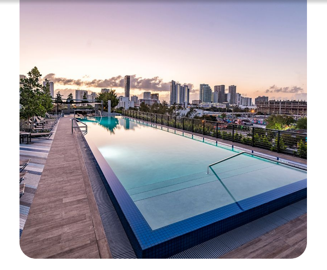
Sentral Wynwood Miami, Florida

Miami's vibrant Wynwood district is known for funky art galleries, hip breweries, and trendy restaurants. Sentral Wynwood's designer-furnished apartments are perfect for the stylish traveler looking to stay in the hip area for a short or extended visit. The art-inspired property features a picturesque rooftop terrace with outdoor kitchen and dining areas, a resort-style rooftop pool and cabanas, and a state-ofthe-art health and fitness center. Choose from spacious studios and one- or twobedroom units—all complete with the familiar comforts of home like a washer and dryer, flat-screen TV, and fullyequipped kitchens with stainless steel appliances.