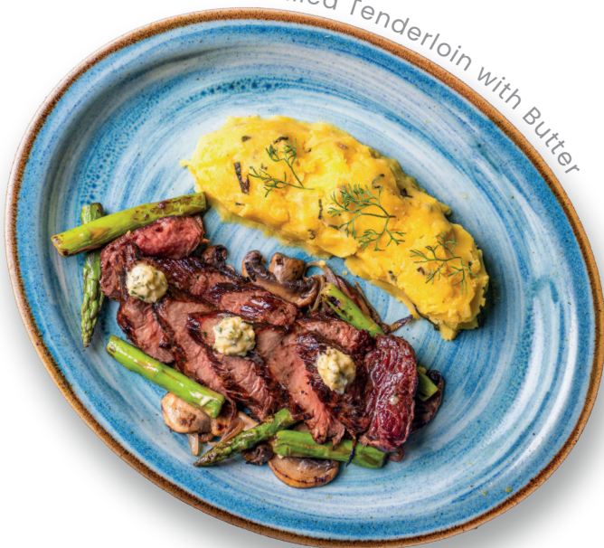
Grilled Tenderloin with Butter