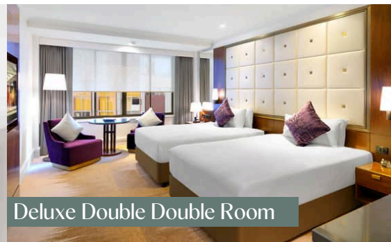
Deluxe Double Double Room