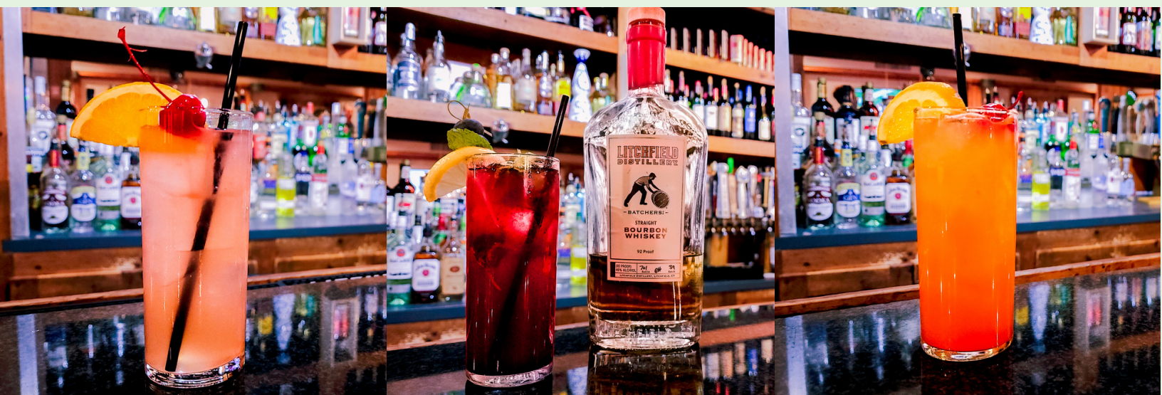
JG's Sweet & Delicious