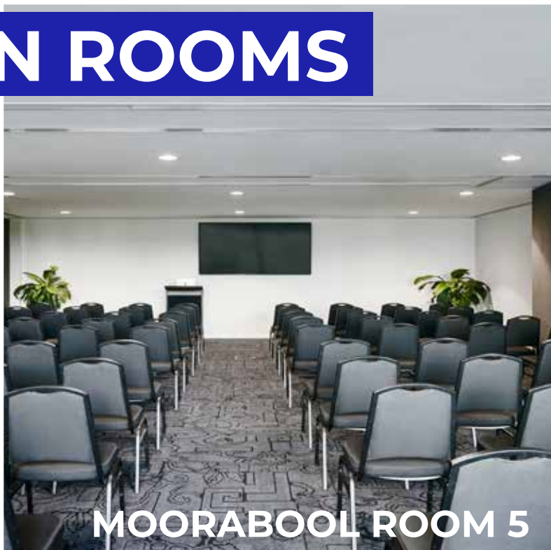
MOORABOOL ROOM 5