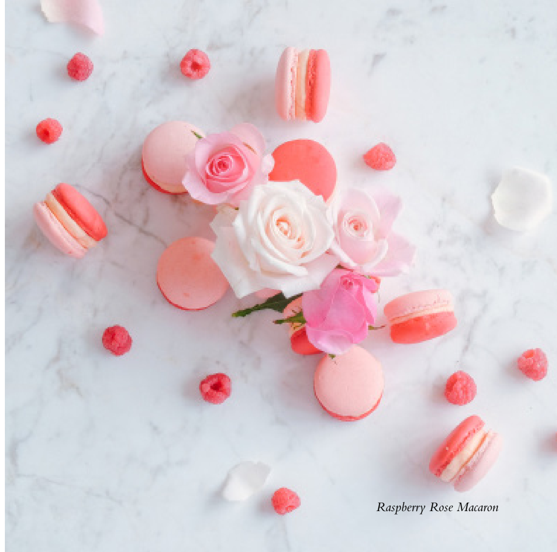
Raspberry Rose Macaron

All prices are times 1,000 in Vietnam Dong (VND) and are subject to service charge and then VAT