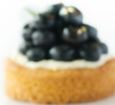
Blueberry Crème Fraîche Tart