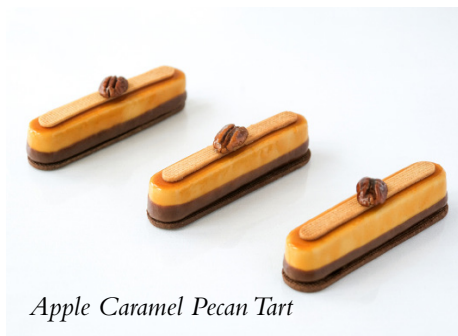
Apple Caramel Pecan Tart