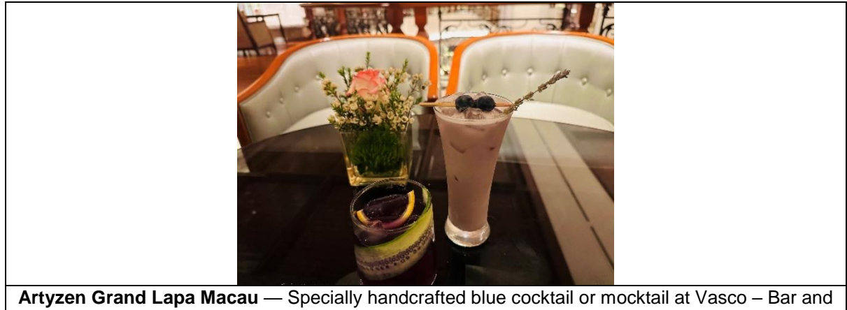
Lounge to celebrate Earth Hour