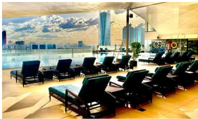
Pool Bar Lounge Chairs