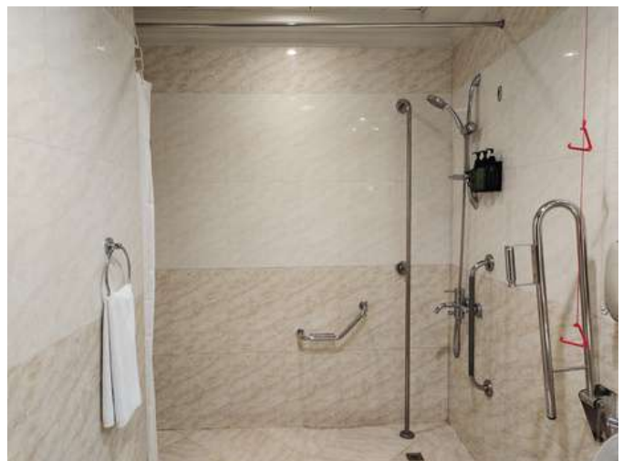
Ceiling-mounted Pull cord panic alarm, walk-in shower and grab bars installed