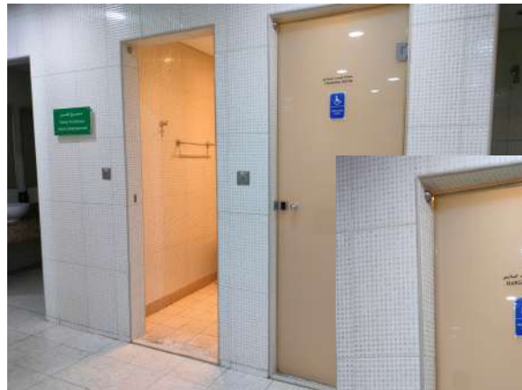
Changing room for the physically challenged at the ladies toilet near the pool area