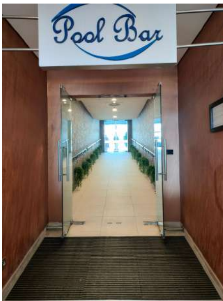
Pool Bar Entrance

The 25m swimming pool is situated on the 8th floor along with kids pool next to the Pool bar and are easily accessible by wheelchair. There's also a designated changing room for the physically challenged in the male changing room. However, the female changing room does not have the same facility even though it is accessible by wheelchair. There is a toilet for the physically challenged for male and female combined near the fitness studio.