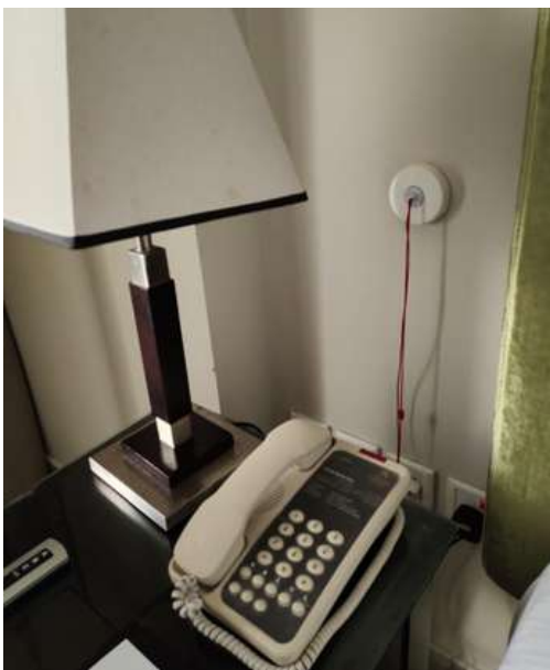
Pull cord panic alarm on the bedside