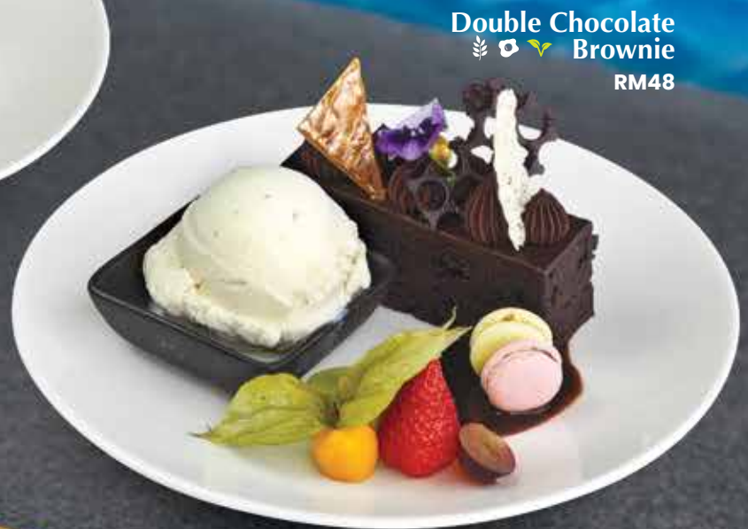
Double Chocolate Brownie 🌿 🥚 🌱 RM48