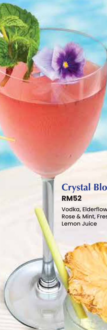
Crystal Bloom RM52

Gin, Lychee, Vanilla Jasmine, Fresh Lemon Juice