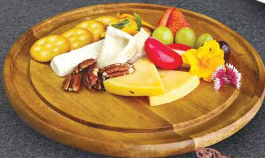
Cheese Platter 🥥 🌿 🌱 RM48