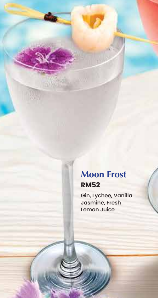
Moon Frost RM52

Gin, Lychee, Vanilla Jasmine, Fresh Lemon Juice