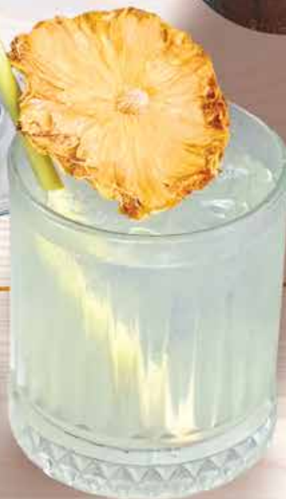
White Mirage RM52

White Rum, Coconut Water, Lemon Thyme, Fresh Lime Juice, Aquafaba