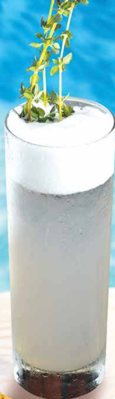
Silver Dew RM52

Vodka, Elderflower, Rose & Mint, Fresh Lemon Juice