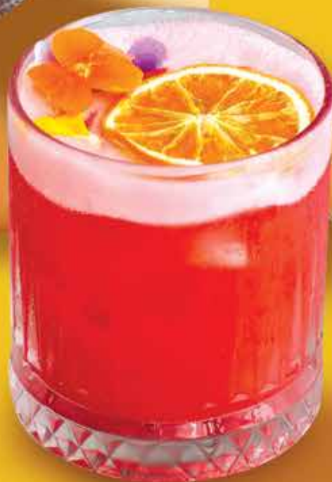
Crimson Tide RM52

Tequila, Grapefruit, Spiced Agave, Fresh Lemon Juice