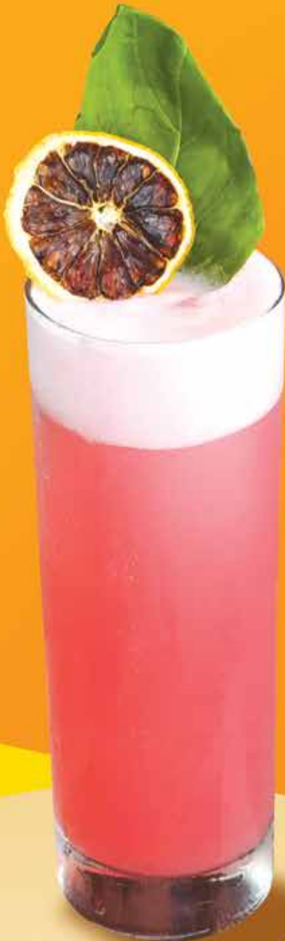
Scarlet Horizon RM52

Vodka, Cranberry, Raspberry & Basil, Fresh Lemon Juice, Aquafaba