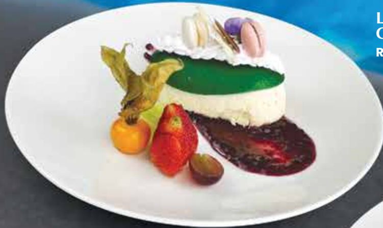
Lime Cheesecake 🌿 🥚 🌱 RM42