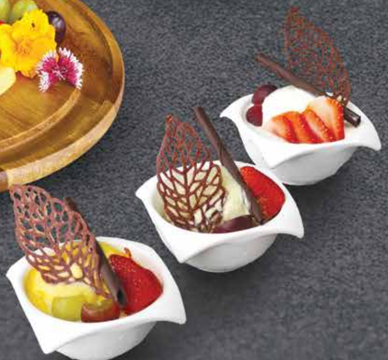
Gelatos 🌱 RM20