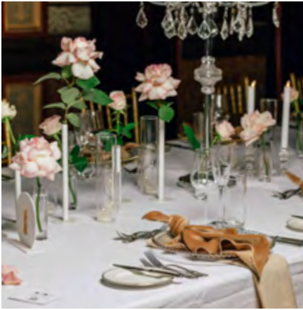
Event Merchant Co.

From vintage-inspired to contemporary designs, Event Merchant Co. specialises in high quality dinner plates, charger plates, and styling to suit your occasion.