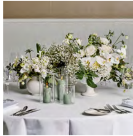
Flair Flowers & Design

Our resident florist specialises in beautiful flower arrangements. Create an air of polished perfection for your bridal party, ceremony and reception.