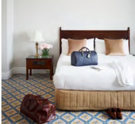
The Deluxe Room

We also offer accommodation for the wedding night and any guests travelling from afar. Special discounts are available for your wedding guests.