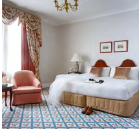
The Windsor Suite