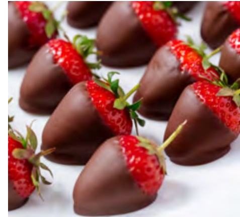
Chocolate Dipped Strawberries