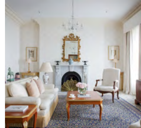
The Royal Suite