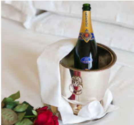
Bottle of Champagne