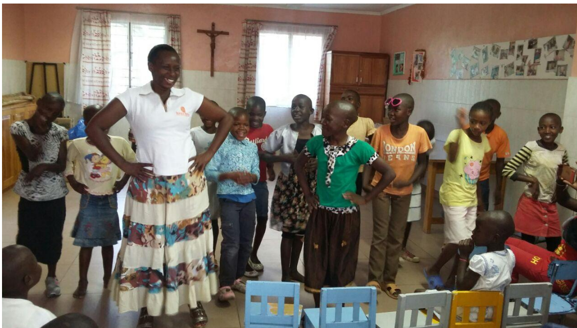
Staff from Lake Elmenteita Serena Camp (LESC) singing songs with the children of The Little Sisters of St. Therese of the Child Jesus House of Hope

Through continued support, LESC hopes to help St. Therese overcome their challenges through providing sustainable solutions in medication and school fees for the children at The Little Sisters of St. Therese of the Child Jesus House of Hope.