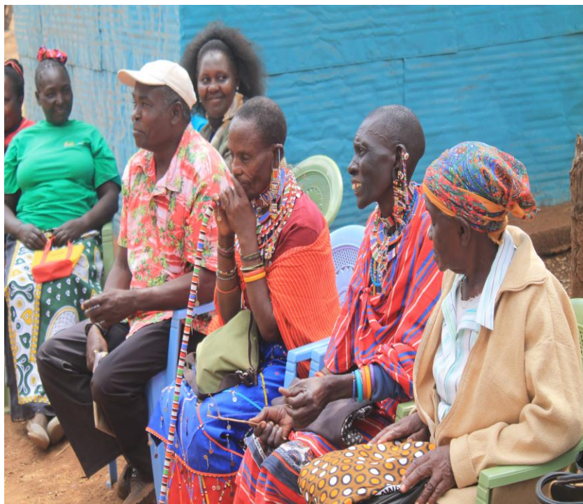
Members from the Kimana Women's Group in Amboseli, Kenya

It has been more than one year since the start of the partnership between a group of rural women small-scale farmers, the International Labour Organization (ILO), African Pro-Poor Tourism Development Centre (APTDC), Tech for Trade and Serena Hotels in the Amboseli, Kenya region. What started as an economic empowerment initiative has now grown to become a sustainable business, where the lives of women and their families have been immensely enhanced.