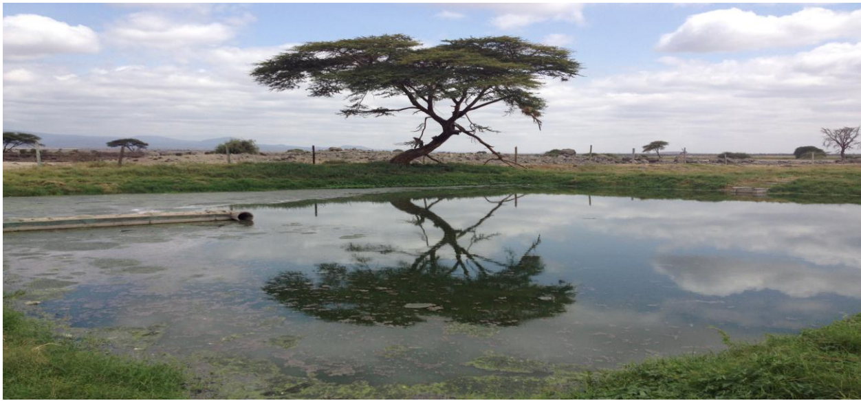
Wastewater Lagoon at Amboseli Serena Safari Lodge in the Amboseli National Park, Kenya

In the 1980's, a Serena Hotels constructed lagoon consisting of six chambers was established at Amboseli Serena Safari Lodge (ASSL) . The Lodge is connected to the lagoon through the use of septic tanks and a drainage system, bringing the wastewater from ASSL 's kitchen, bathrooms and laundry directly into the chambers. Through a process of aeration, oxygenation and sunlight exposure, the water travels throughout each of the six chambers and undergoes a natural cleaning process.