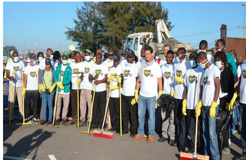
Staff volunteers at Polana Serena Hotel making their way to participate in the beach clean up in Maputo, Mozambique