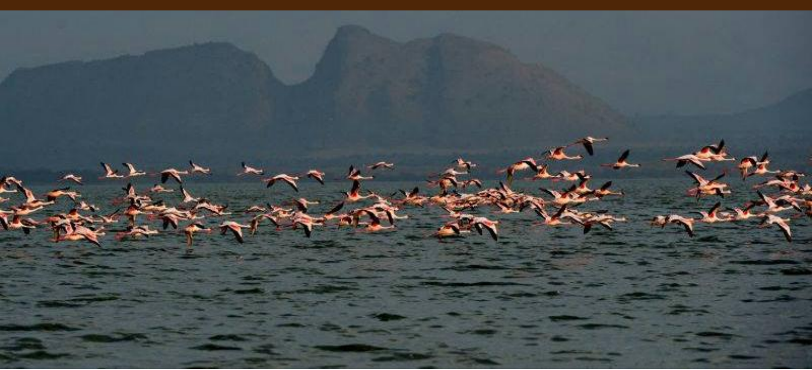
A view of flamingoes and a sleeping warrior opposite Lake Elmenteita Serena Camp (LESC)

On August 21 st 2016, Nature Kenya – the East Africa Natural History Society (EANHS) held a full day bird watching event and lunch at Lake Elmenteita Serena Camp (LESC) in Nakuru, Kenya.