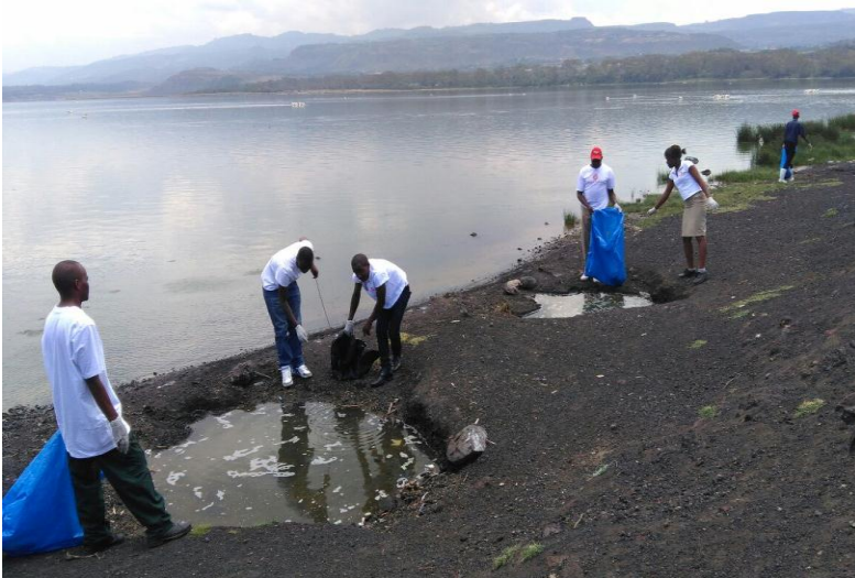
Lake Elmenteita Serena Camp (LESC) staff participate in clean up of hot spring in Nakuru, Kenya

It was the third edition of Polana Serena Hotel’s action towards litter collection and beach clean ups, and this year the Serena city hotel in Maputo, Mozambique organized a clean up on the beach of Costa de Sol. Under the Portuguese slogan, “Juntos Fazemos a Diferença” meaning “Together We Make A Difference”, a team of 60 volunteers from Bigservice, Disotel-Sternblu, Flor Real, Kukula, Rentokil and SIQAS e Vibeiras joined staff from Polana Serena Hotel one more time to support this worthy cause.