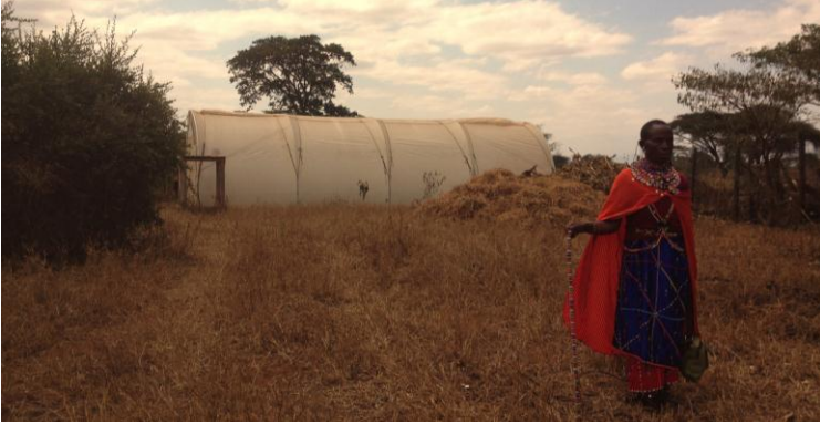
Maasai woman entrepreneur from the Kimana Women's Group in Amboseli, Kenya