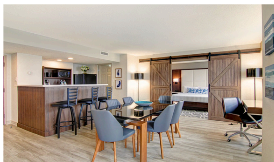
THE PARK SUITE