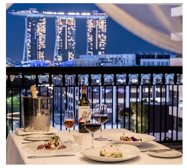
Rooftop Dining at Grand Park City Hall

There's an option for those who want some time on this rooftop hideaway but prefer table service, too. Choose the gazebo and dine under a dreamy white muslin roof. Floating spheres of coloured light gently illuminate a table draped with snowy white linen, perfectly set up with the flatware and china needed for Tablescape's 4-course degustation menu. Set in a discreet corner of the terrace, the sparkling lights of the cityscape accompany the elegant meal to create a tablescape like no other.