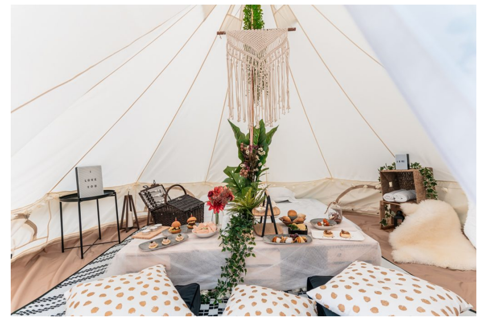
Glamping Picnic at Grand Park City Hall

And as its name suggests, the Glamping Picnic experience offers an exclusive picnic menu – a luxurious, generous spread, considerately presented as two-bite dainties that are easy to eat even when lounging.