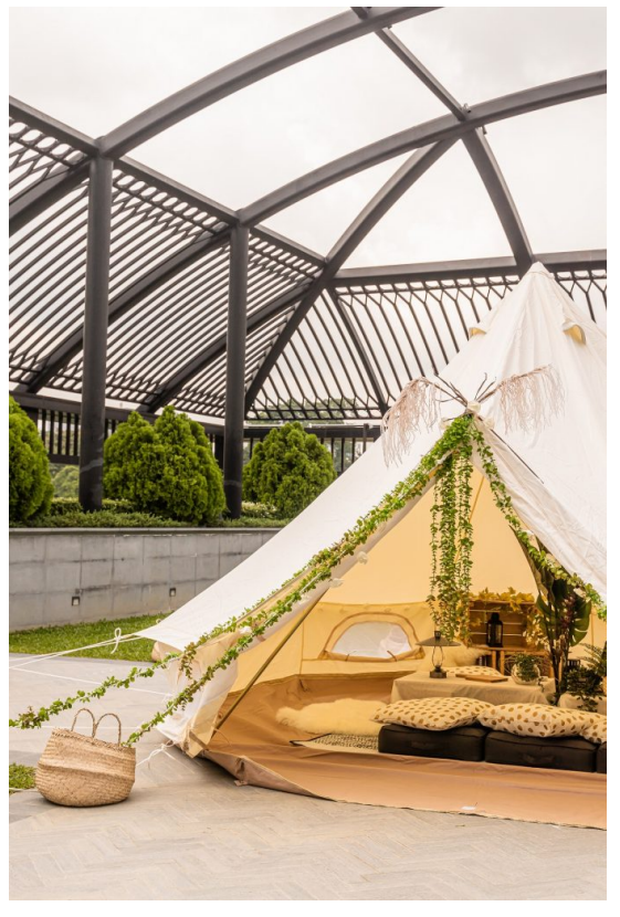
Glamping Tent at Grand Park City Hall

SINGAPORE – Imagine – a deep blue sky streaked with fiery oranges and pinks as the sun leisurely sets in the distance. A tall white tent, plush with cushions, air-cooled interiors – and you and your friends toasting one another with flutes of champagne as you nibble on lobster, foie gras and cheese. This could be your reality – simply by reserving the new Glamping Picnic experience with Tablescape.