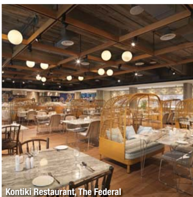
Kontiki Restaurant, The Federal

Whether you are traveling, for business or pleasure, you will enjoy warm hospitality, excellent facilities, strategic locations - that's the FHI promise.