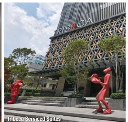
Tribeca Serviced Suites