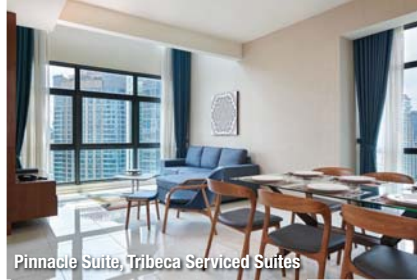
Pinnacle Suite, Tribeca Serviced Suites

GDS Code: WV Amadeus: KUL672 Galileo: E4453 Sabre: 318427 Worldspan: KUL72