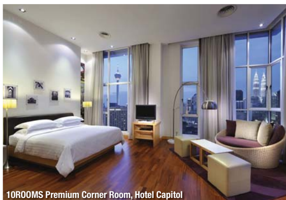
10ROOMS Premium Corner Room, Hotel Capitol