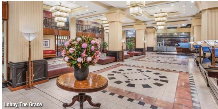
Lobby, The Grace