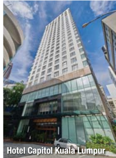
Hotel Capitol Kuala Lumpur

GDS Code: WV Amadeus: SYDFOC Galileo: 82925 Sabre: 11679 Worldspan: SYDHB