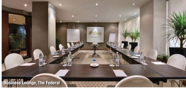
Business Lounge, The Federal

Federal Hotels International Sdn Bhd (Co. No. 197301002307 (15802-K)) c/o Federal Kuala Lumpur, 35, Jalan Bukit Bintang, 55100 Kuala Lumpur, Malaysia. +603 2148 0468 fhisales@fhi.com.my fhihotels.com