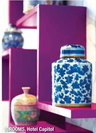
10ROOMS, Hotel Capitol

GDS Code: WV Amadeus: KULCHL Galileo: 6604 Sabre: 46088 Worldspan: 80091