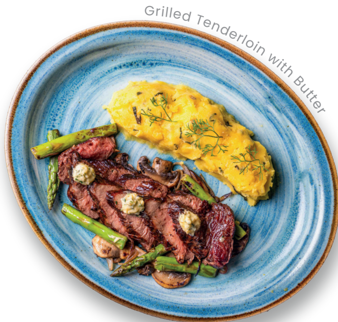
Grilled Tenderloin with Butter