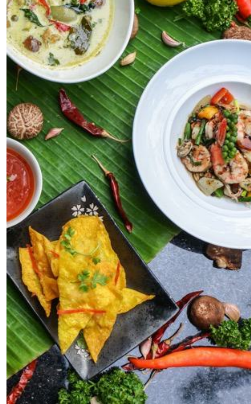
U NIMMAN CHIANG MAI U NIMMAN CHIANG MAI'S SONGKRAN SPLASH