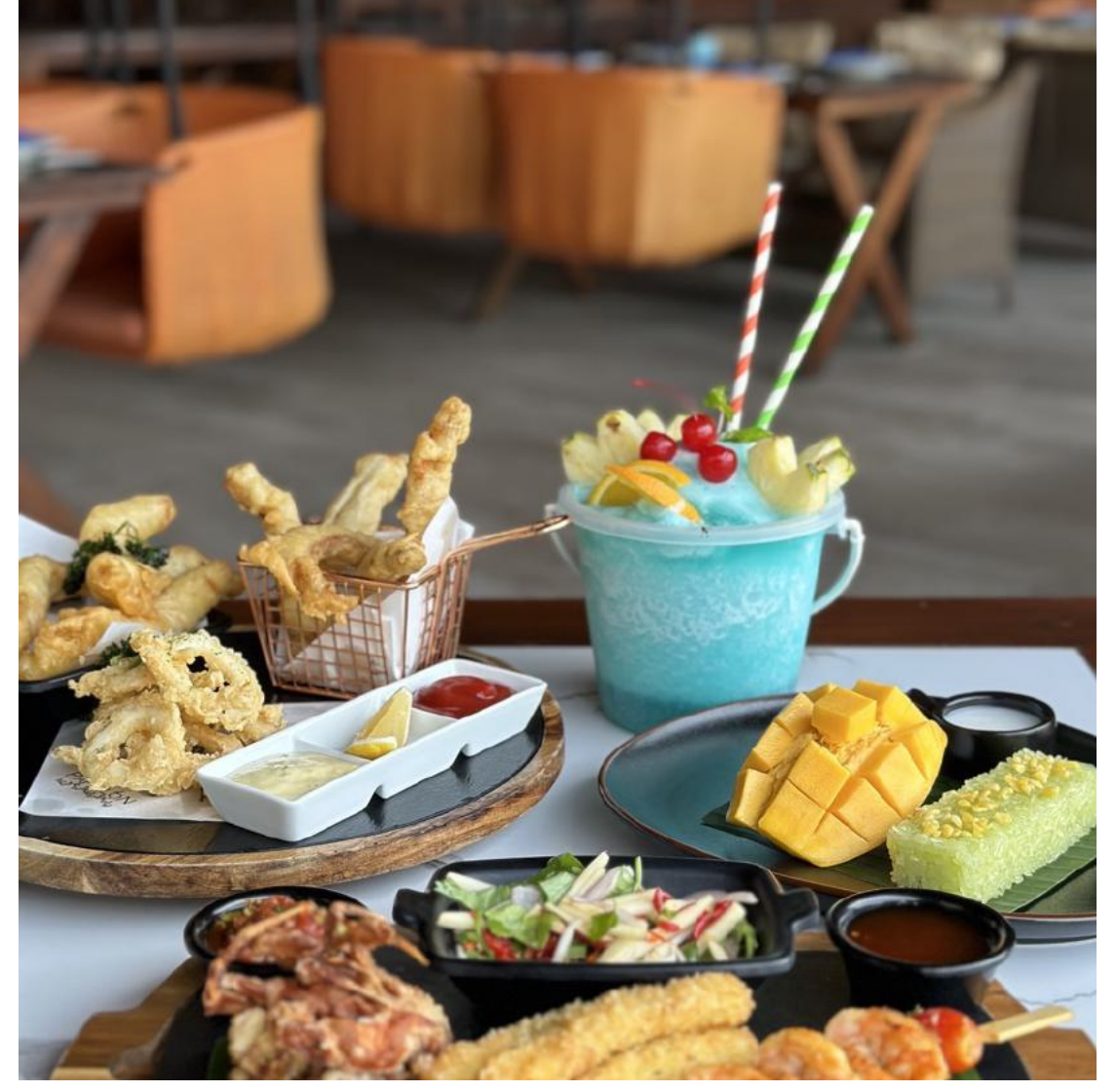
U PATTAYA Special Songkran and Water Activities on the Beach