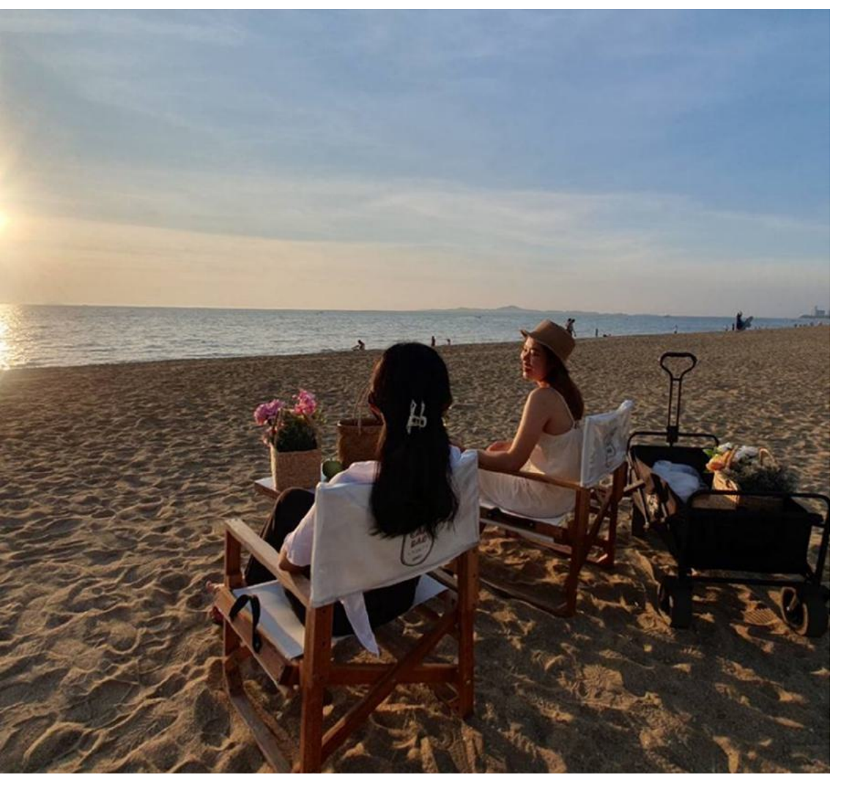
U JOMTIEN PATTAYA PICNIC & HAPPY HOUR SUNSETS ON THE BEACH