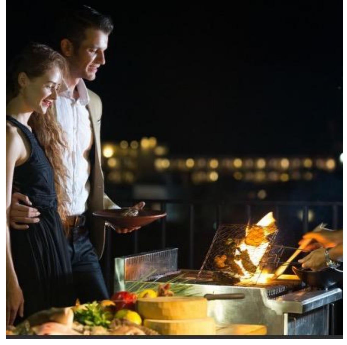
U PAASHA SEMINYAK BALI BBQ Friday