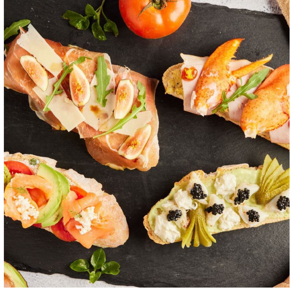
U SATHORN BANGKOK Introducing our Weekend Poolside Brunch