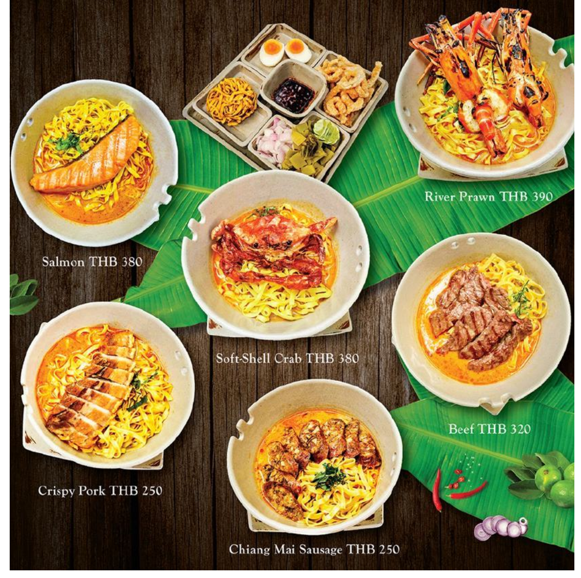
U CHIANG MAI 'Khao Soi' – A Must Try