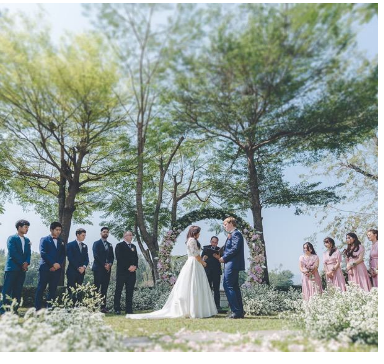
U INCHANTREE KANCHANABURI UR PERFECT WEDDING BY THE RIVER