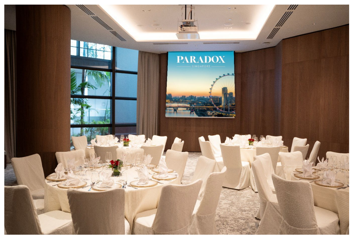
Sandalwood Intimate Dinner Layout