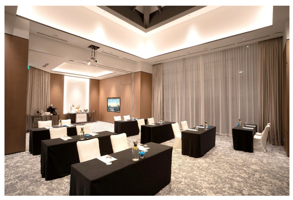
Inkwood Business Meeting Classroom Layout Expanse View