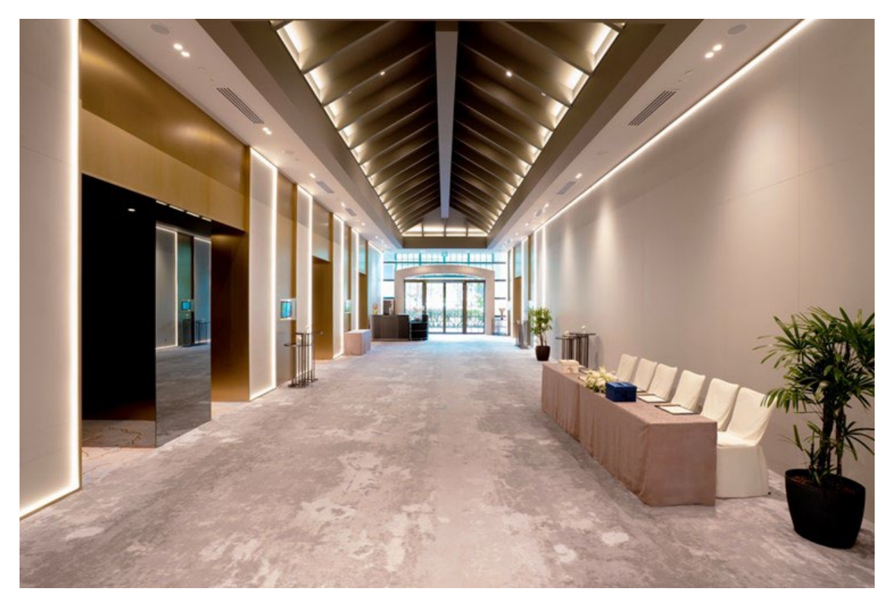
Ballroom Exclusive Foyer