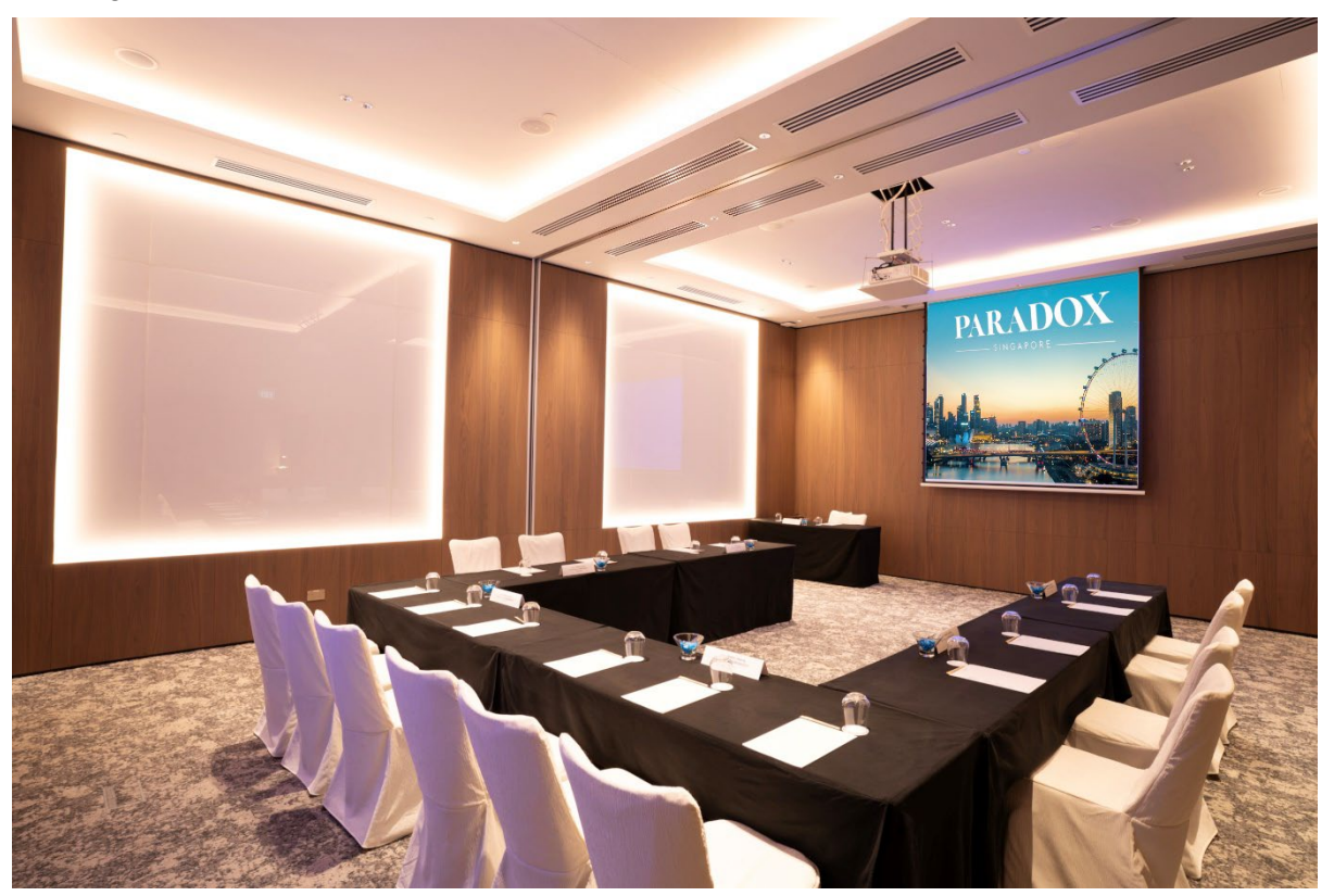
Elmwood Business Meeting U-Shaped Layout Expanse View