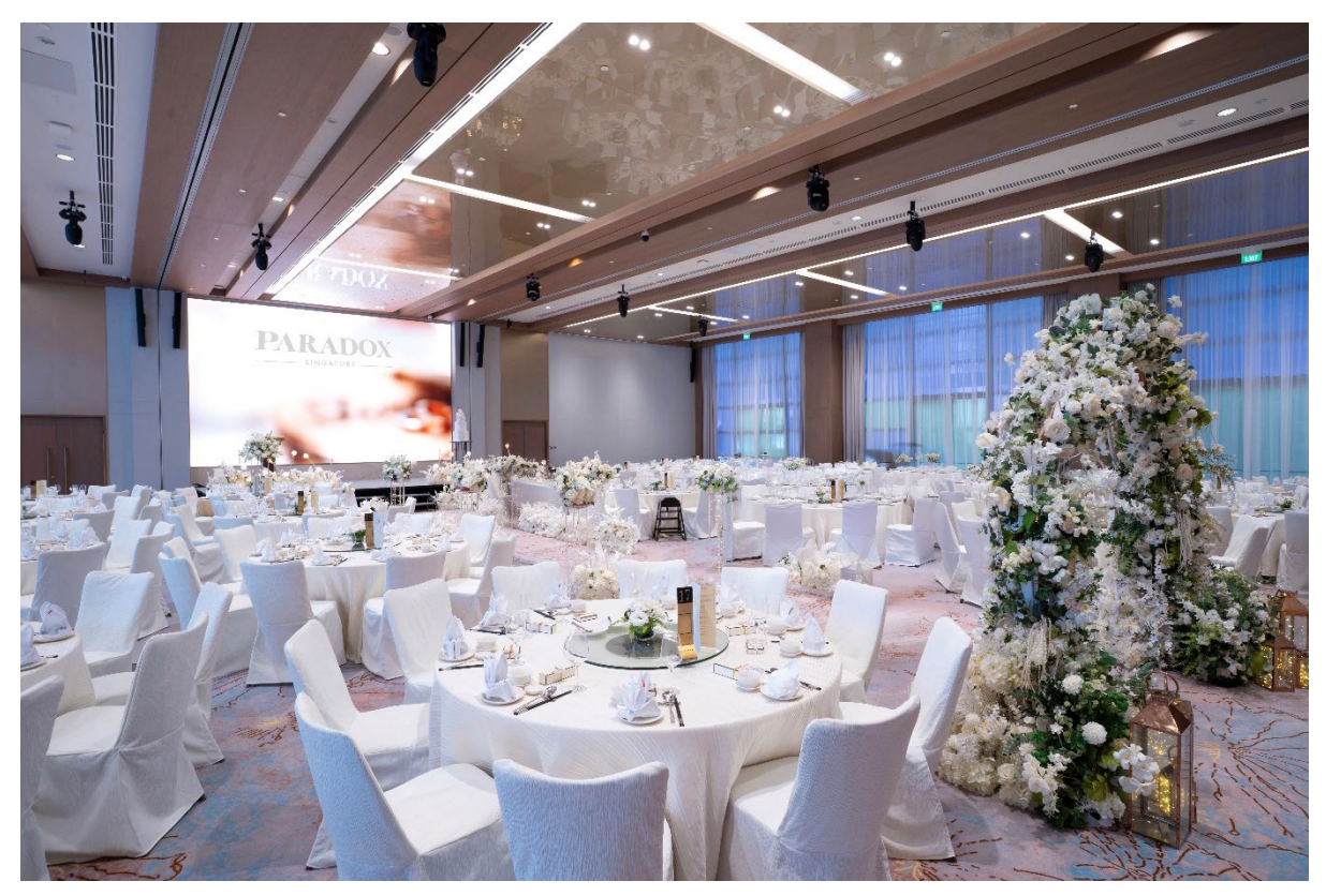
Ballroom Wedding Window View