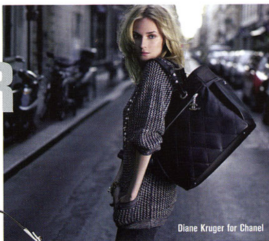
Diane Kruger for Chanel