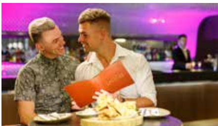
The place to meet.