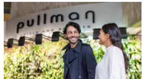
Arrive in style at Pullman.