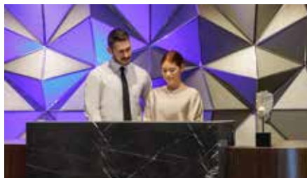
24-hour reception and on site concierge.