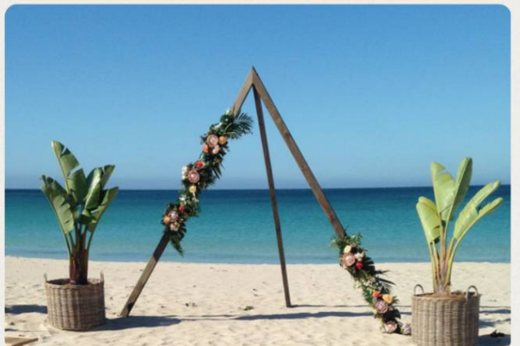
BUNKER BAY BEACH