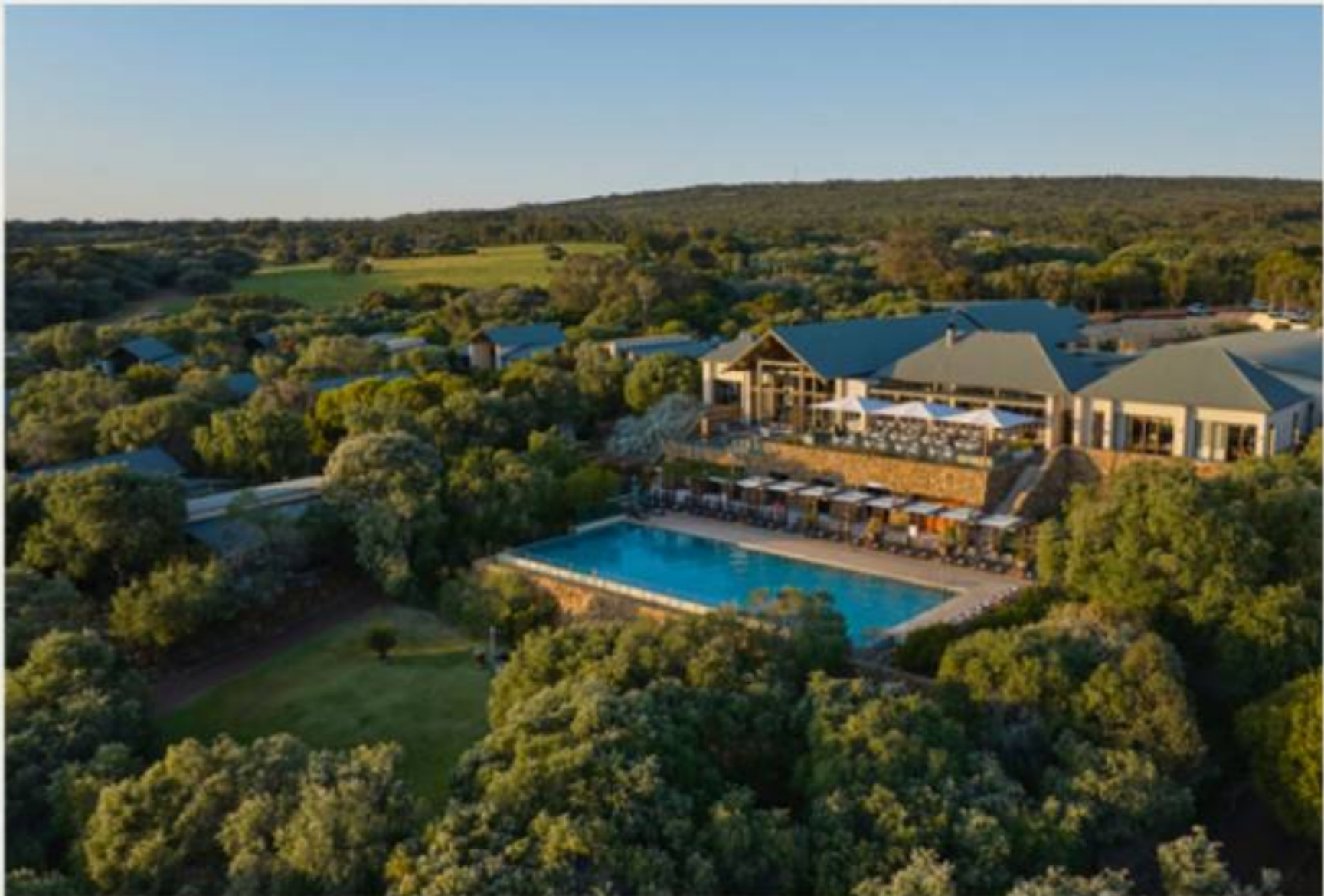
HEATED INFINITY POOL