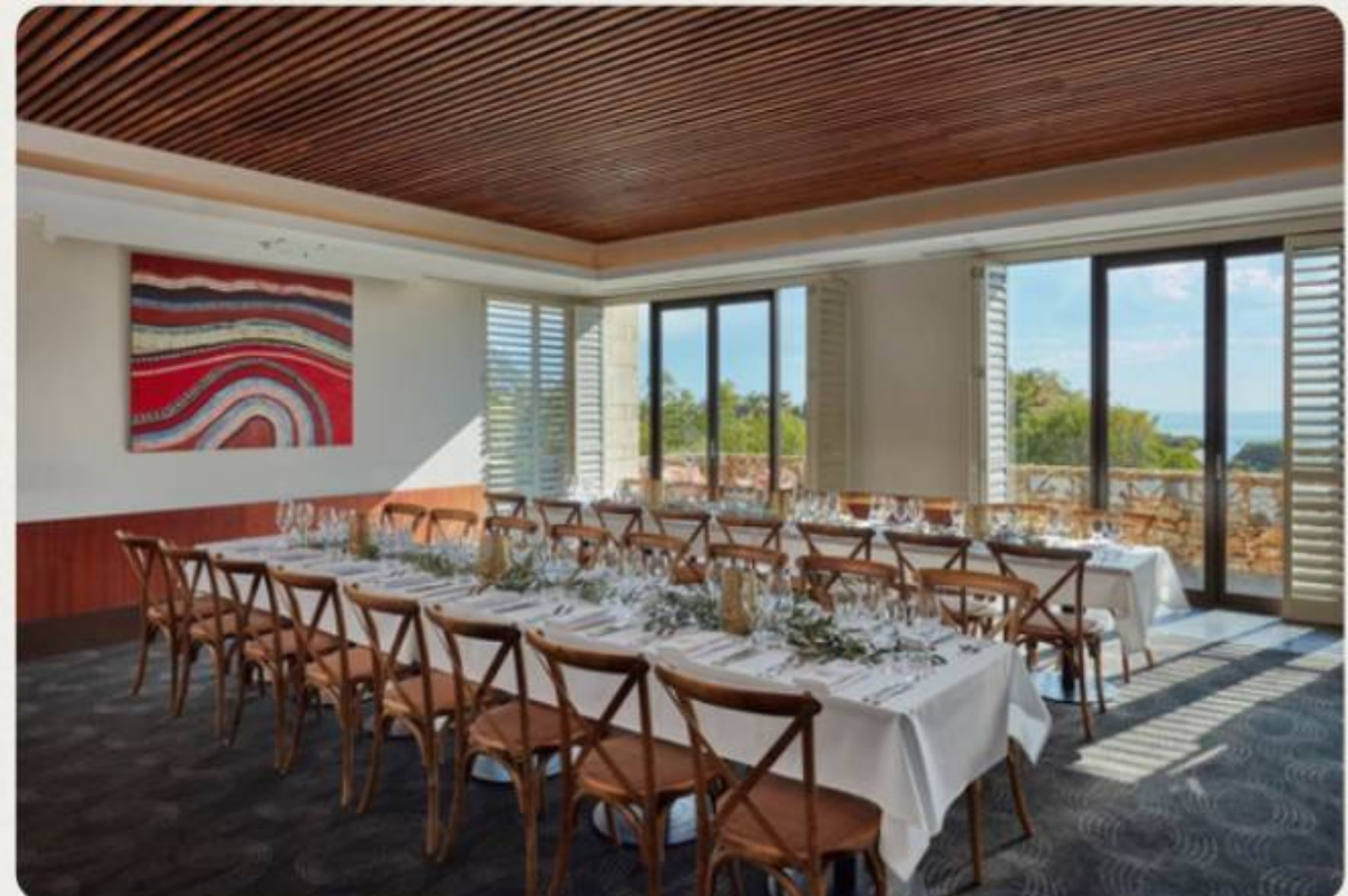
WARDAN & TERRACE