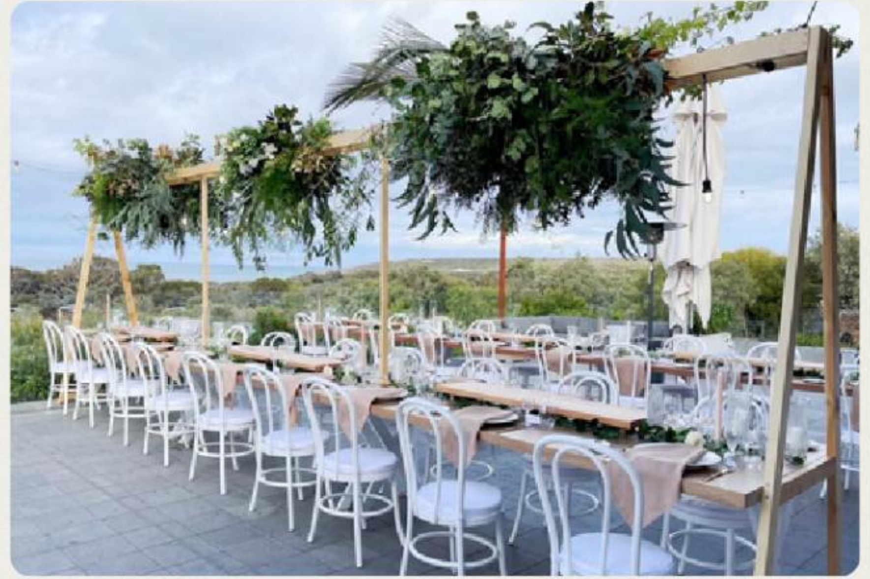
THE OCEAN TERRACE