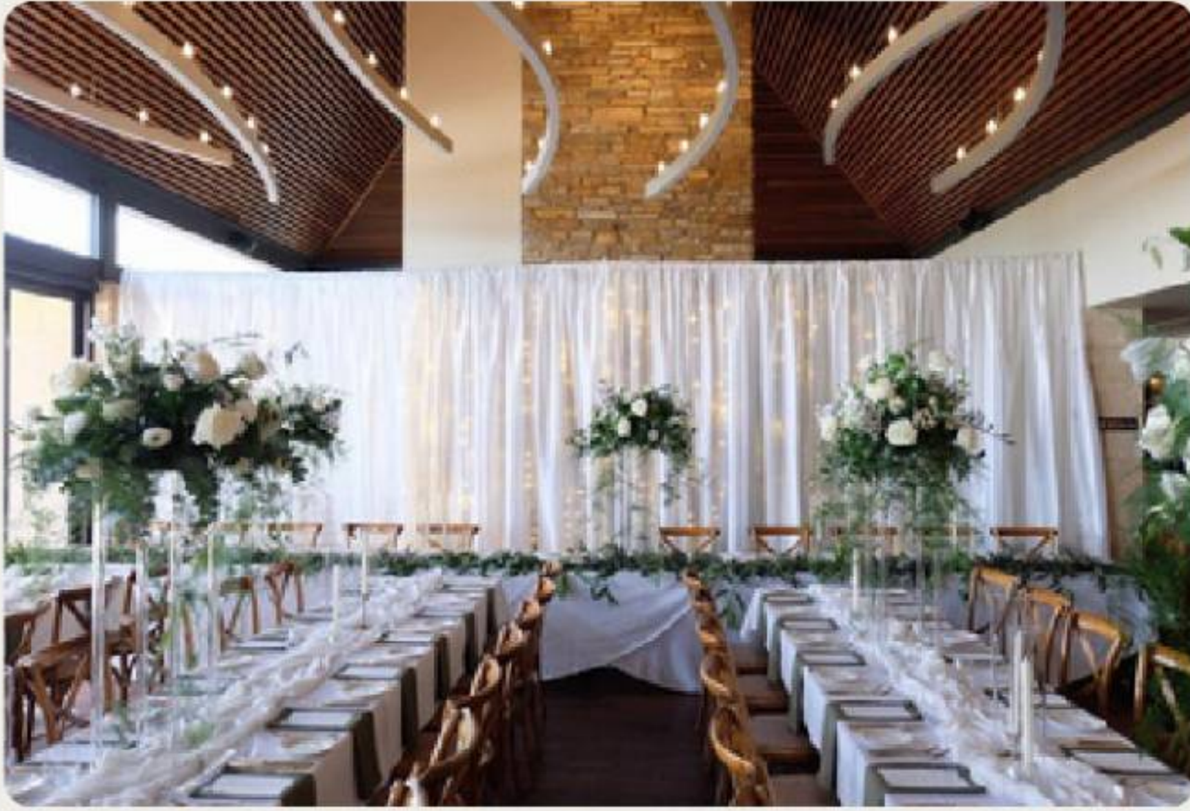
OTHERSIDE OF THE MOON