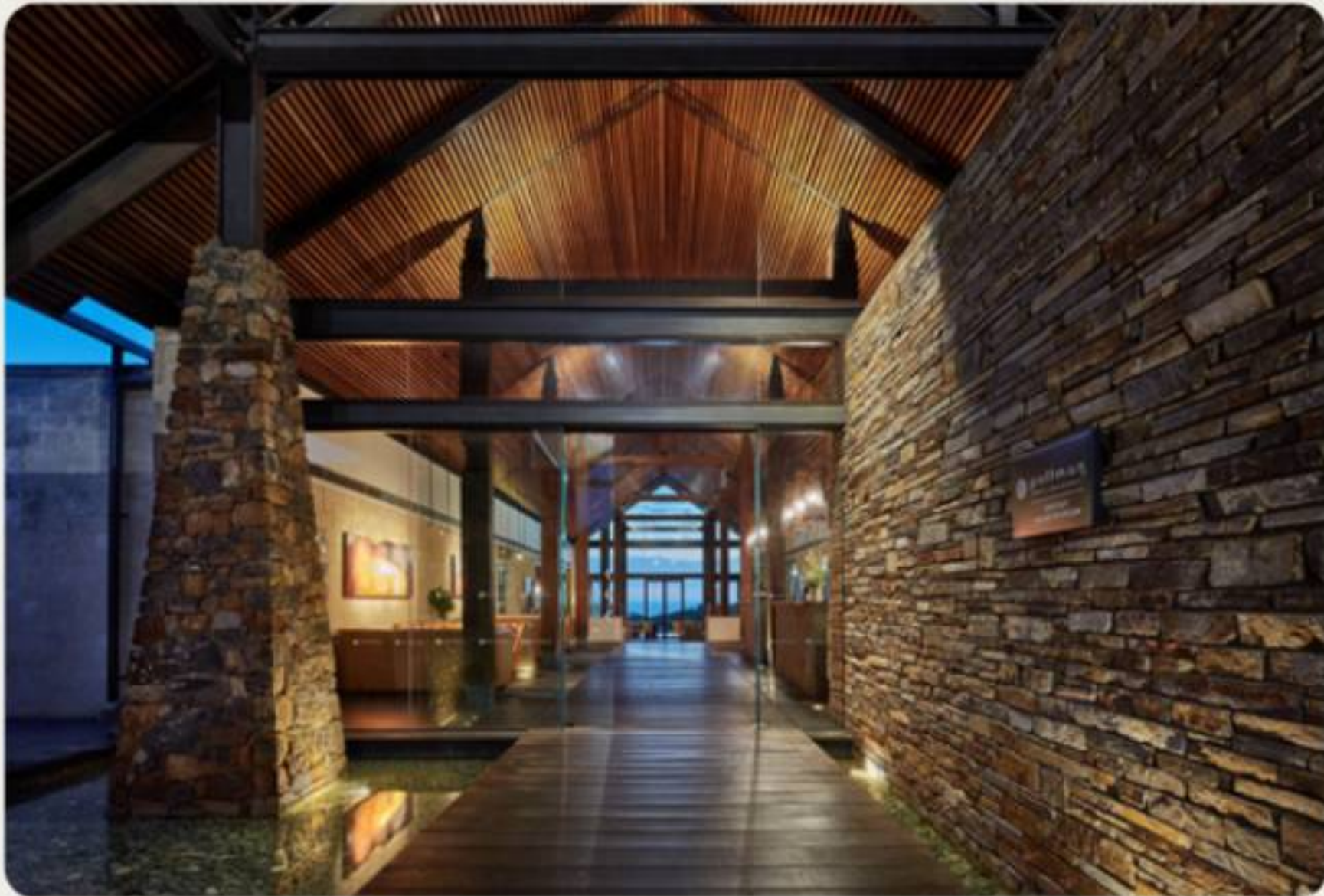
FRONT ENTRANCE AND RECEPTION