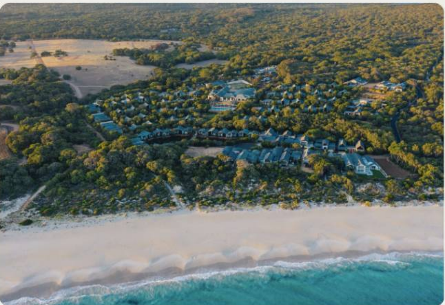
PRIVATE ACCESS TO BUNKER BAY BEACH