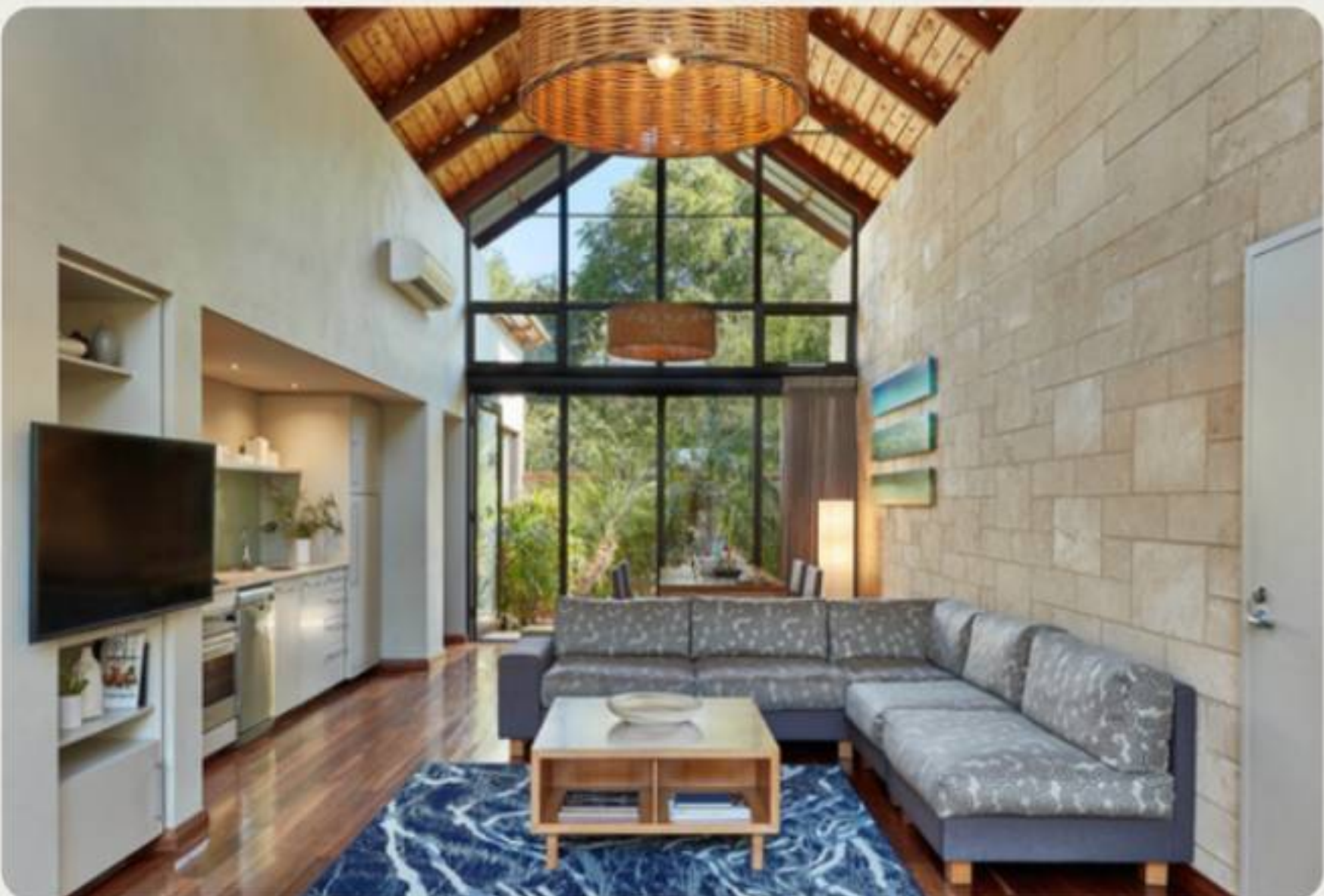
150 SELF-CONTAINED VILLAS