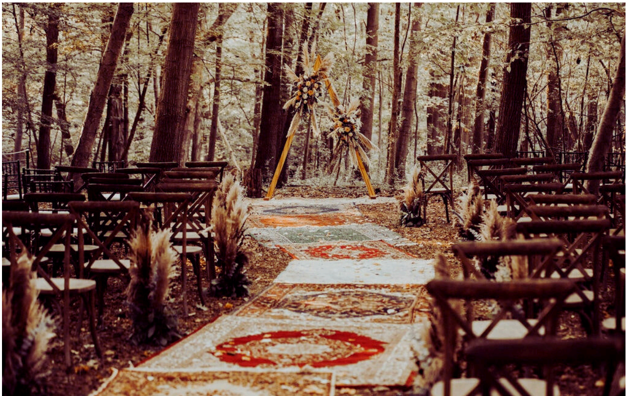
Ceremony in the Woods (arbor, chairs & setup not included)