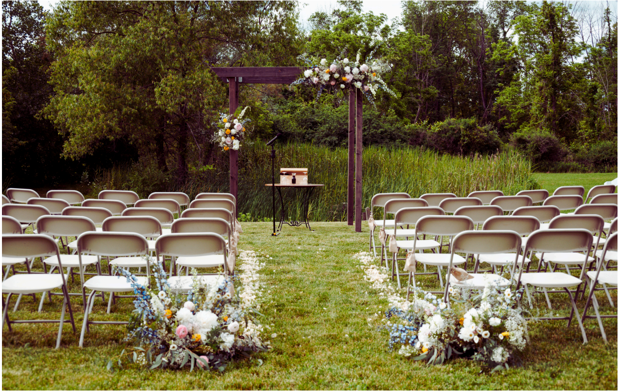
Ceremony on the Lawns (arbor & chairs included)