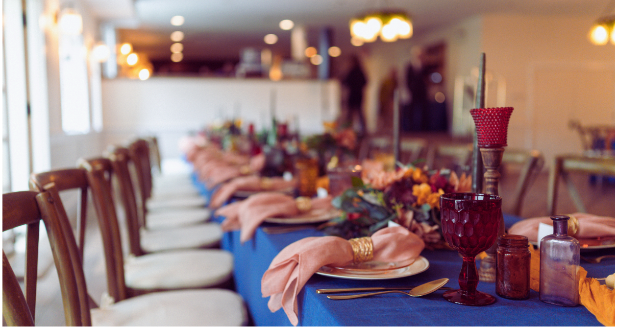
The Buttermilk Ballroom

The Ballroom: Located on the lower level of La Tourelle, the Buttermilk Ballroom combines classic elegance with modern touches. Gold accents, wood-look tile, and x-back chairs create a warm, refined atmosphere, while dimmable lighting and a mezzanine bar overlooking the main floor make the space ideal for celebration and connection.