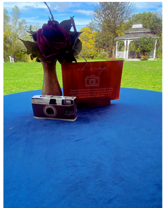
Ballroom Covered Terrace

The Terrace: Included with all ballroom events, the covered terrace offers a seamless indoor-outdoor flow—perfect for cocktail hours, photo booths, or rehearsal dinners. The nearby lawns, featuring three gazebos, provide space for lawn games or relaxed pre- and post-event gatherings.