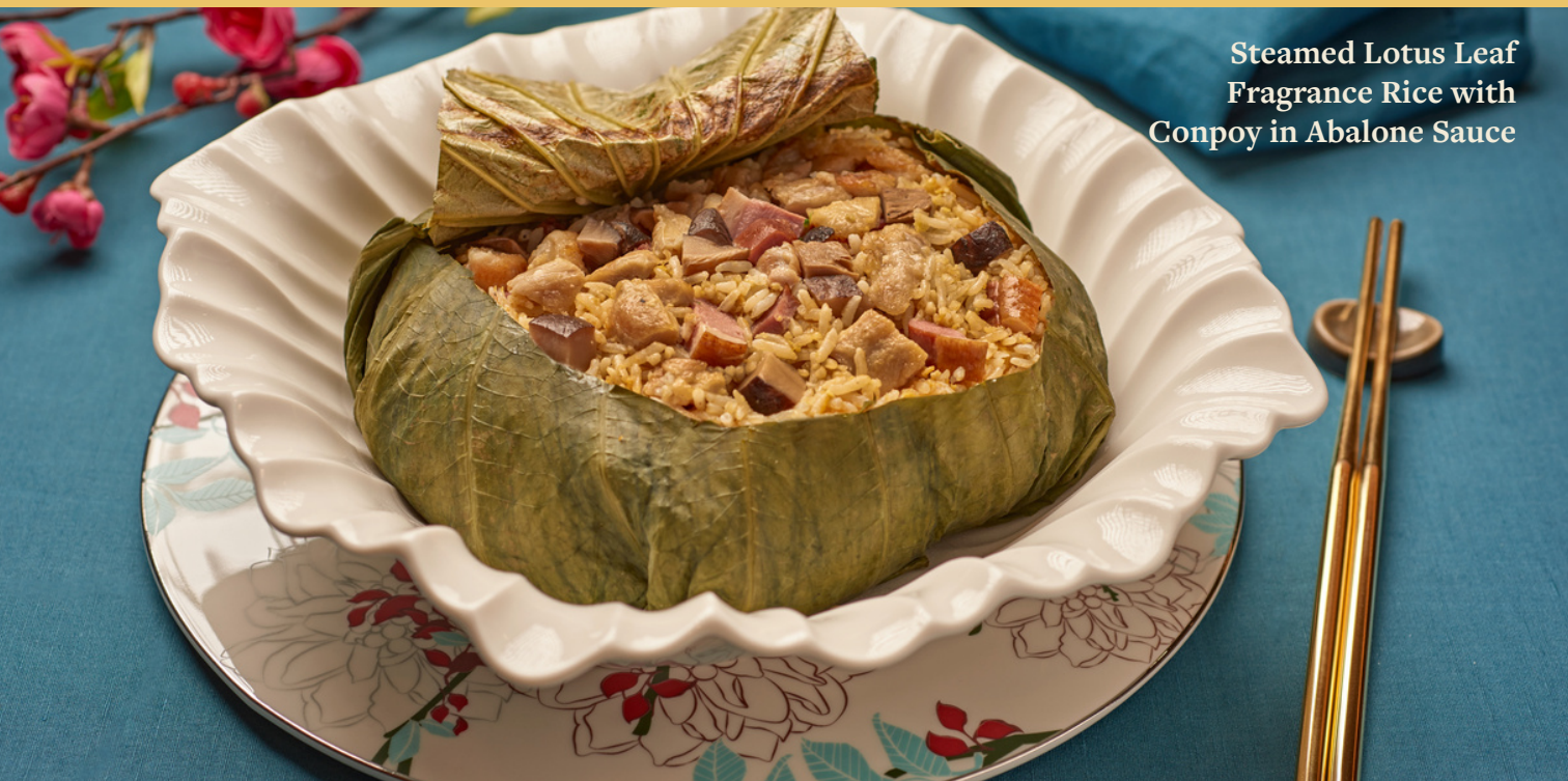
Steamed Lotus Leaf Fragrance Rice with Conpoy in Abalone Sauce