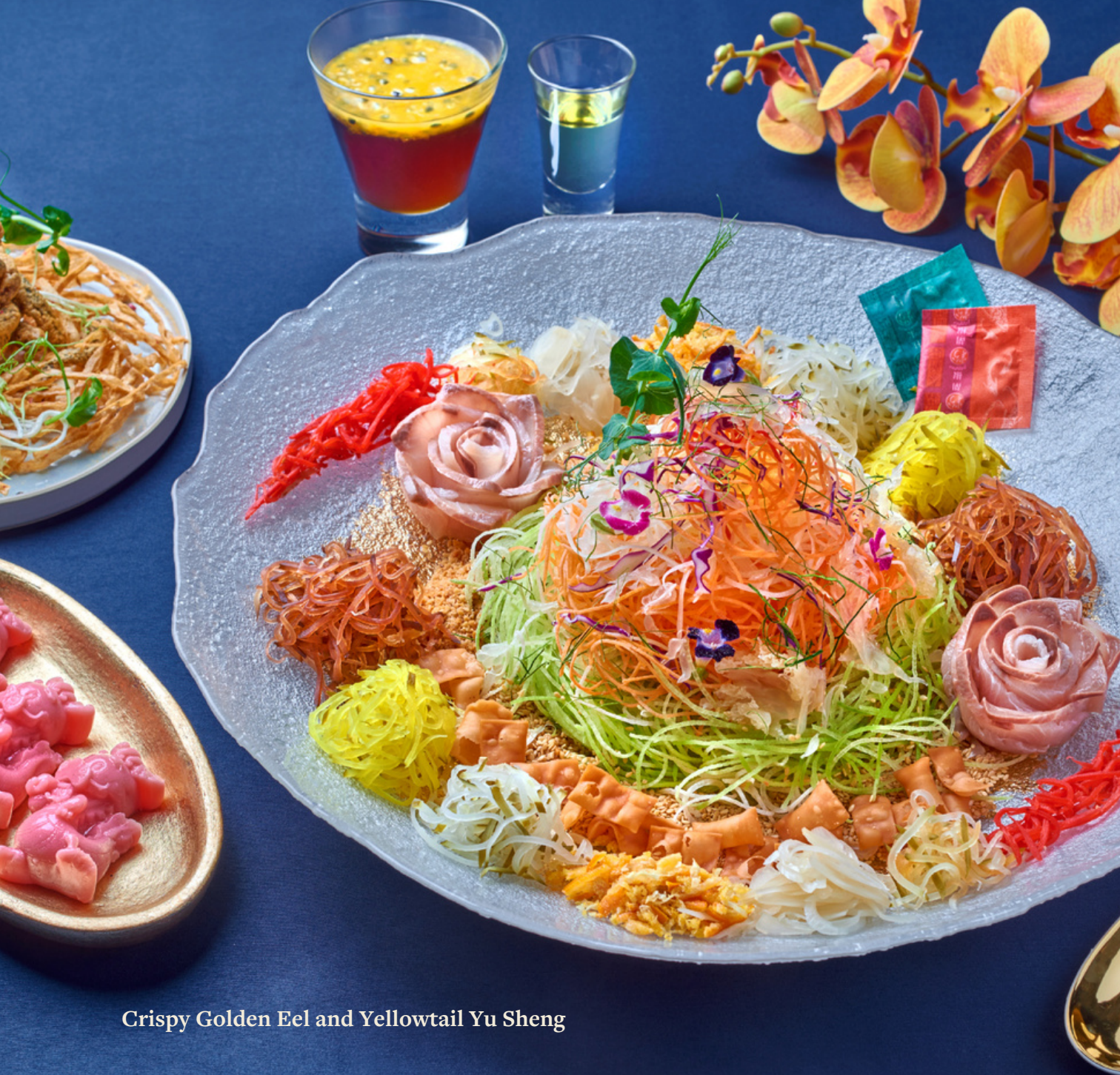
Crispy Golden Eel and Yellowtail Yu Sheng