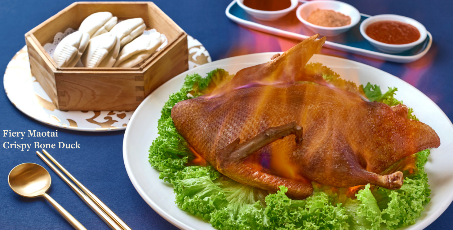
Fiery Maotai Crispy Bone Duck