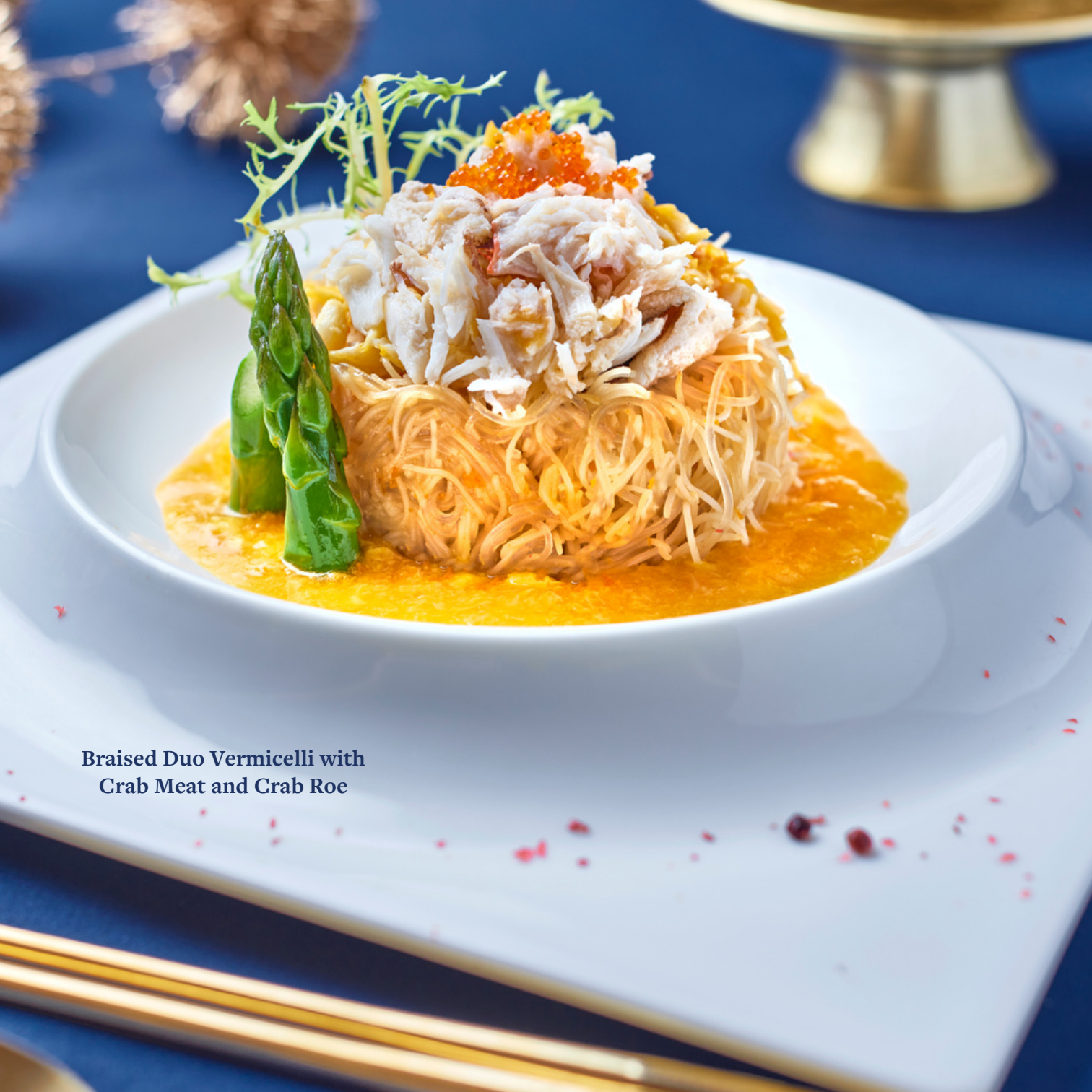
Braised Duo Vermicelli with Crab Meat and Crab Roe