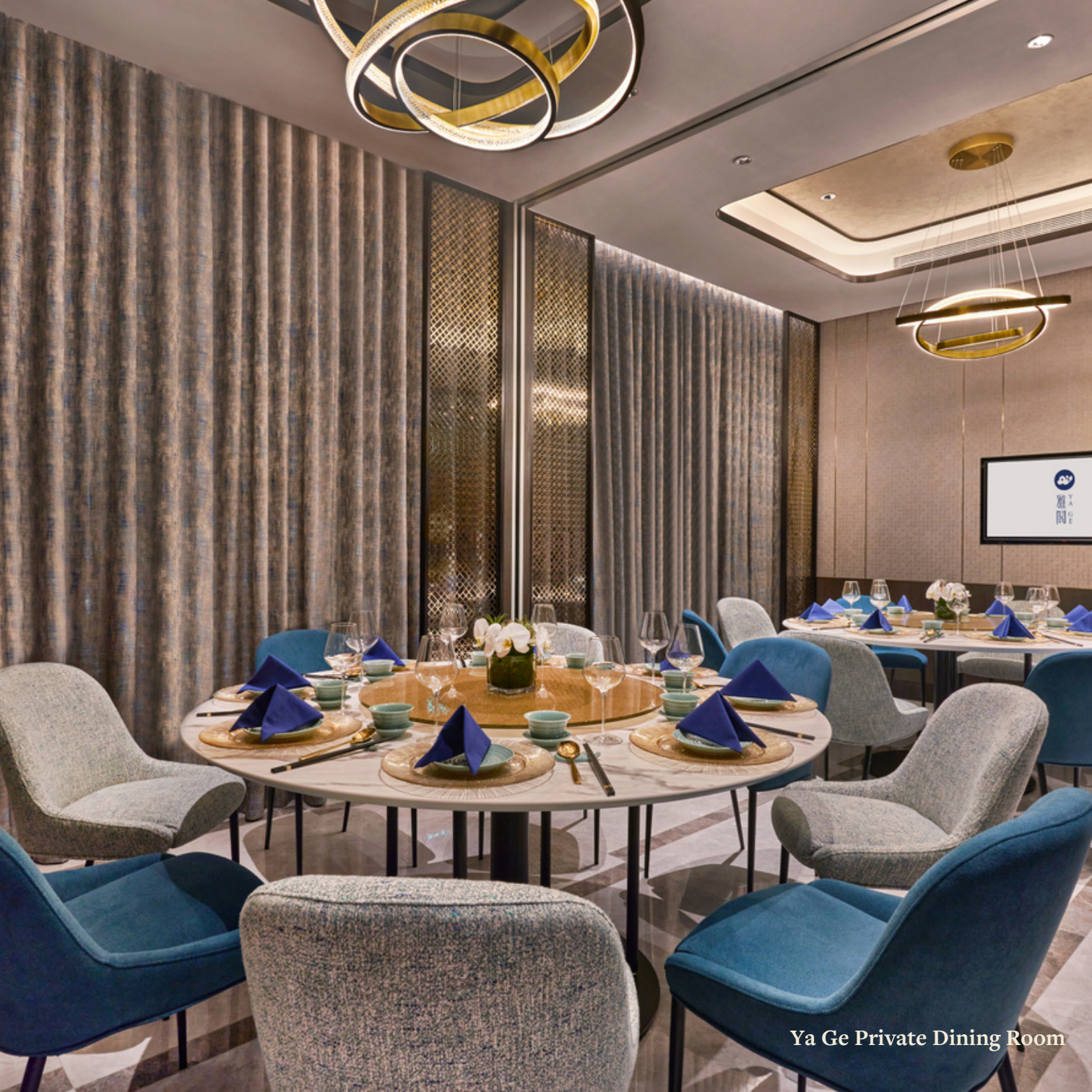
Ya Ge Private Dining Room