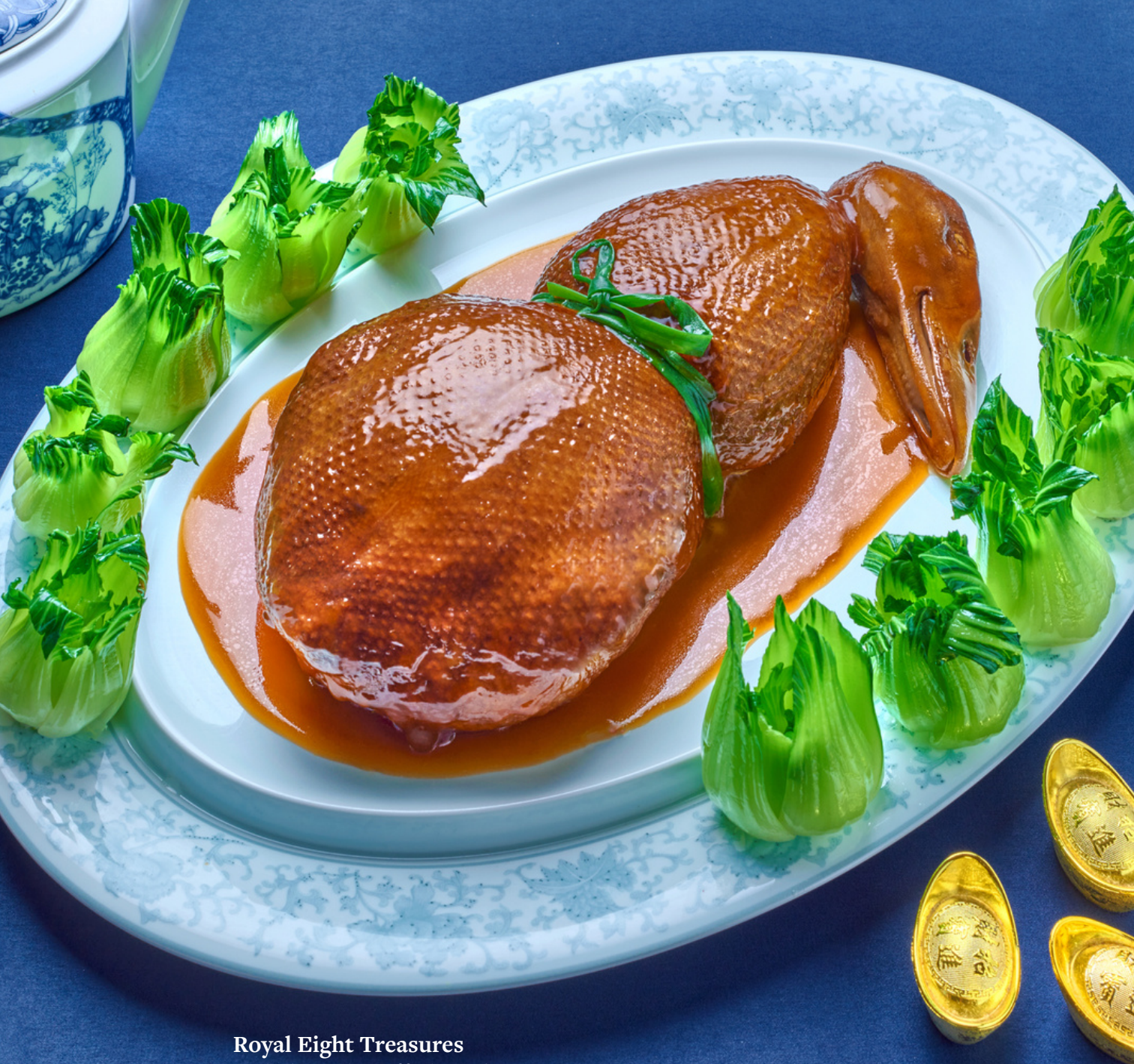
Royal Eight Treasures Gourd-shaped Stuffed Duck