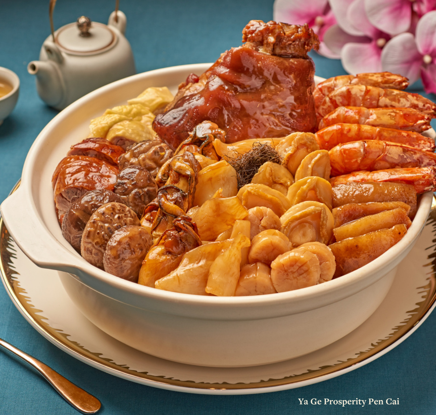
Ya Ge Prosperity Pen Cai