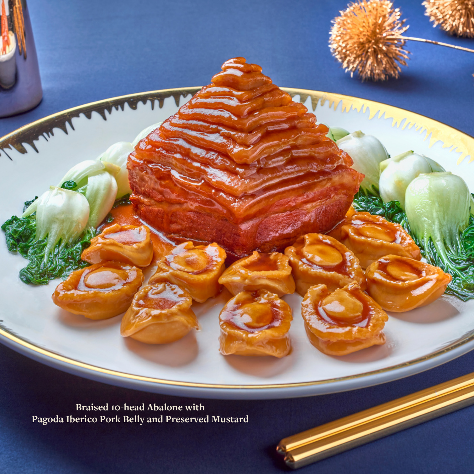
Braised 10-head Abalone with Pagoda Iberico Pork Belly and Preserved Mustard