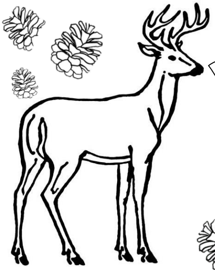
ANSWER: B, 9 Miles