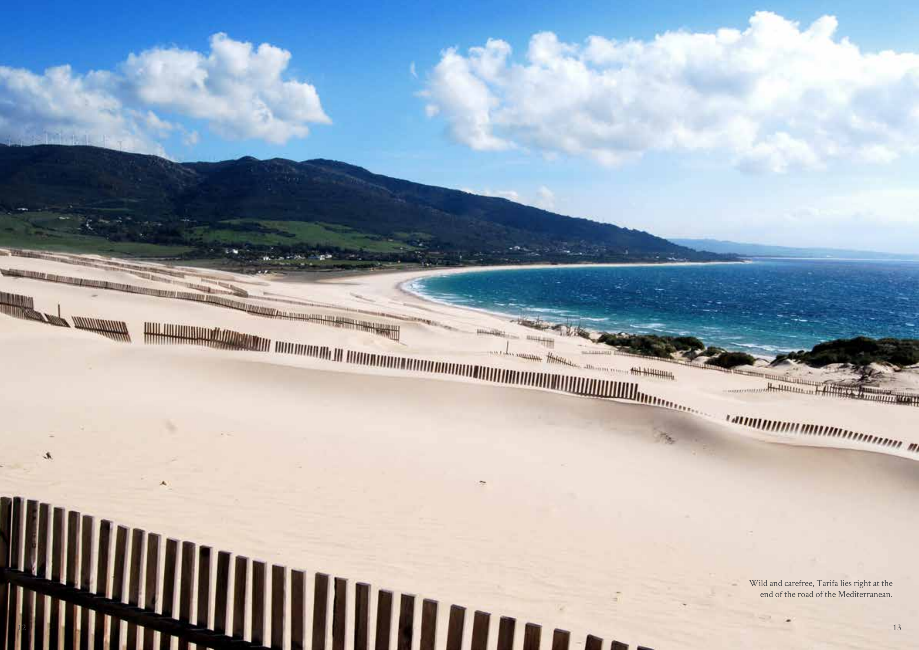
Wild and carefree, Tarifa lies right at the end of the road of the Mediterranean.