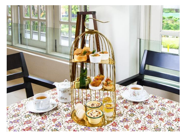
#LoveLocal Tiered Tea Set

Singapore, May 2024 - The distinguished heritage hotel, and an icon amid Singapore's vibrant cityscape Goodwood Park Hotel is pleased to introduce its latest curated tea-time experience as an homage to Singapore's identity as a melting pot of cultures. With eight pairs of bite-sized treats, the exquisite #LoveLocal Tiered Tea Set is a showcase of Singapore's rich and diverse culinary tapestry and can be enjoyed from 13 May at the Hotel's Coffee Lounge , known for its Taiwan Porridge and authentic local fare.