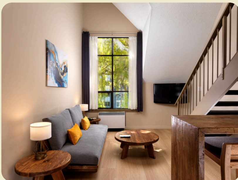
Camden Loft with upcycled wood furniture

GOAL: F&B local sourcing target of 60% and 100% transition to sustainable amenities and supplies