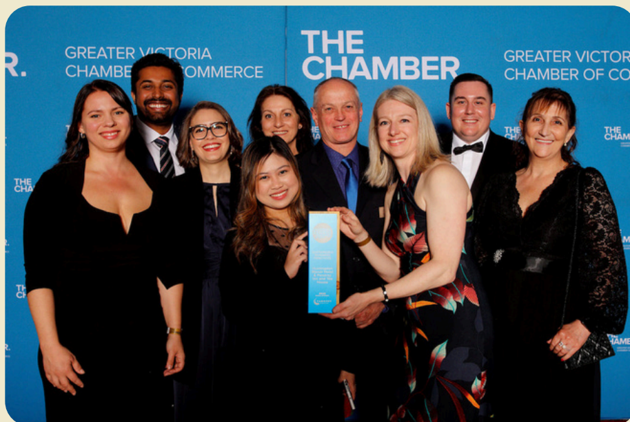
Receiving Chamber of Commerce Sustainability Award