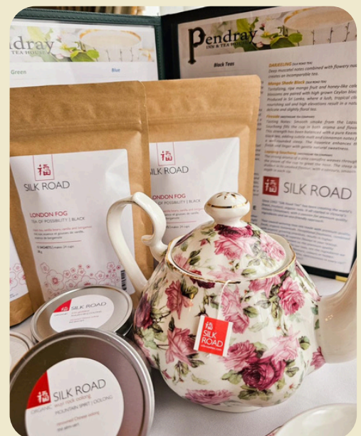
Local organic Silk Road Tea