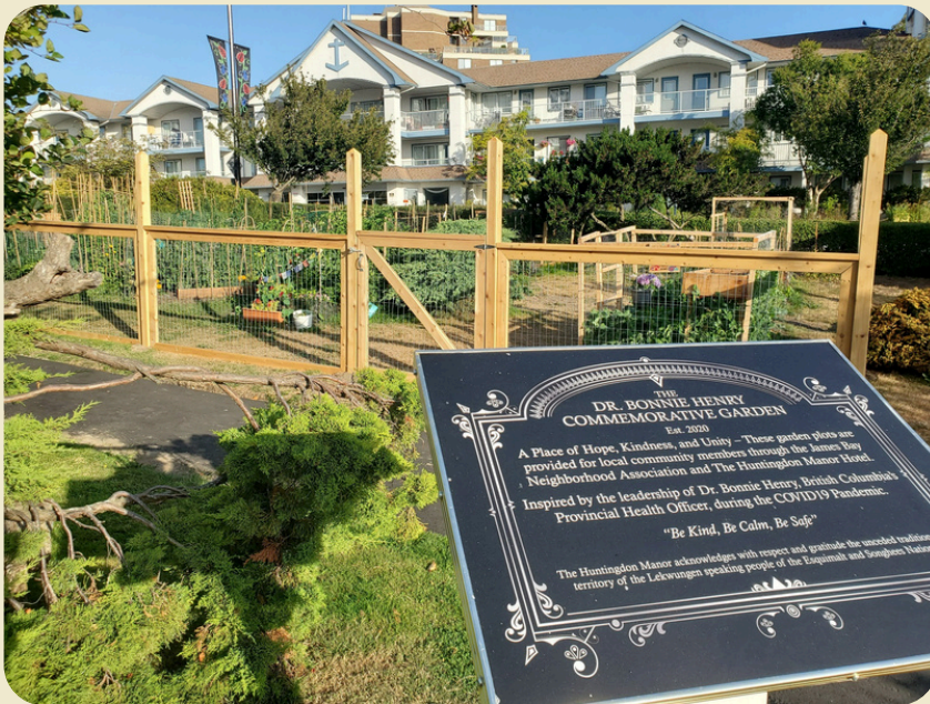
Dr. Bonnie Henry Community Garden