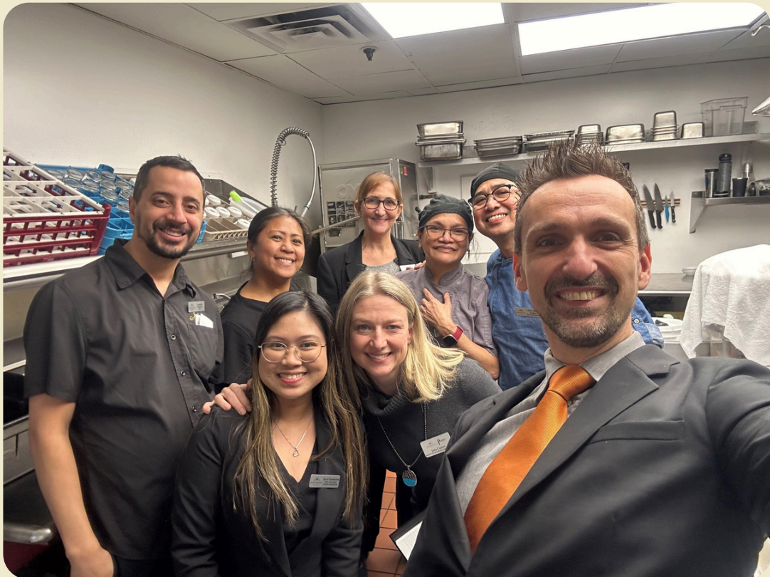
Team completing BetterTable Food Waste Certification Training