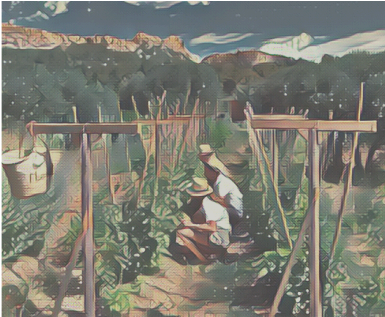
JARDIN EN PERMACULTURE DOMAINE DE MANVILLE