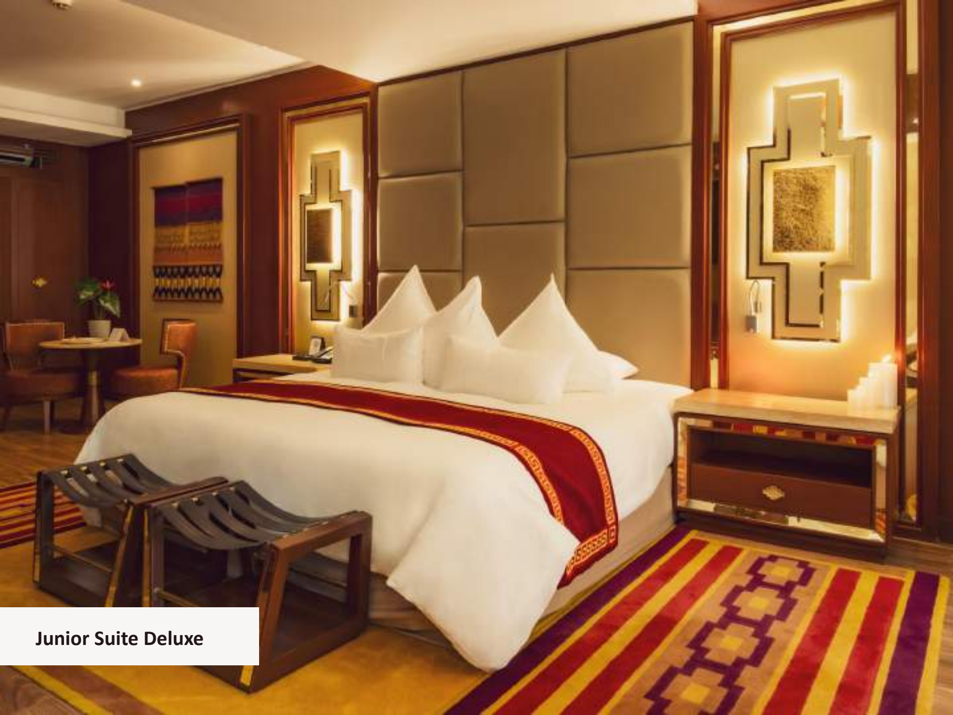
Junior Suite Deluxe