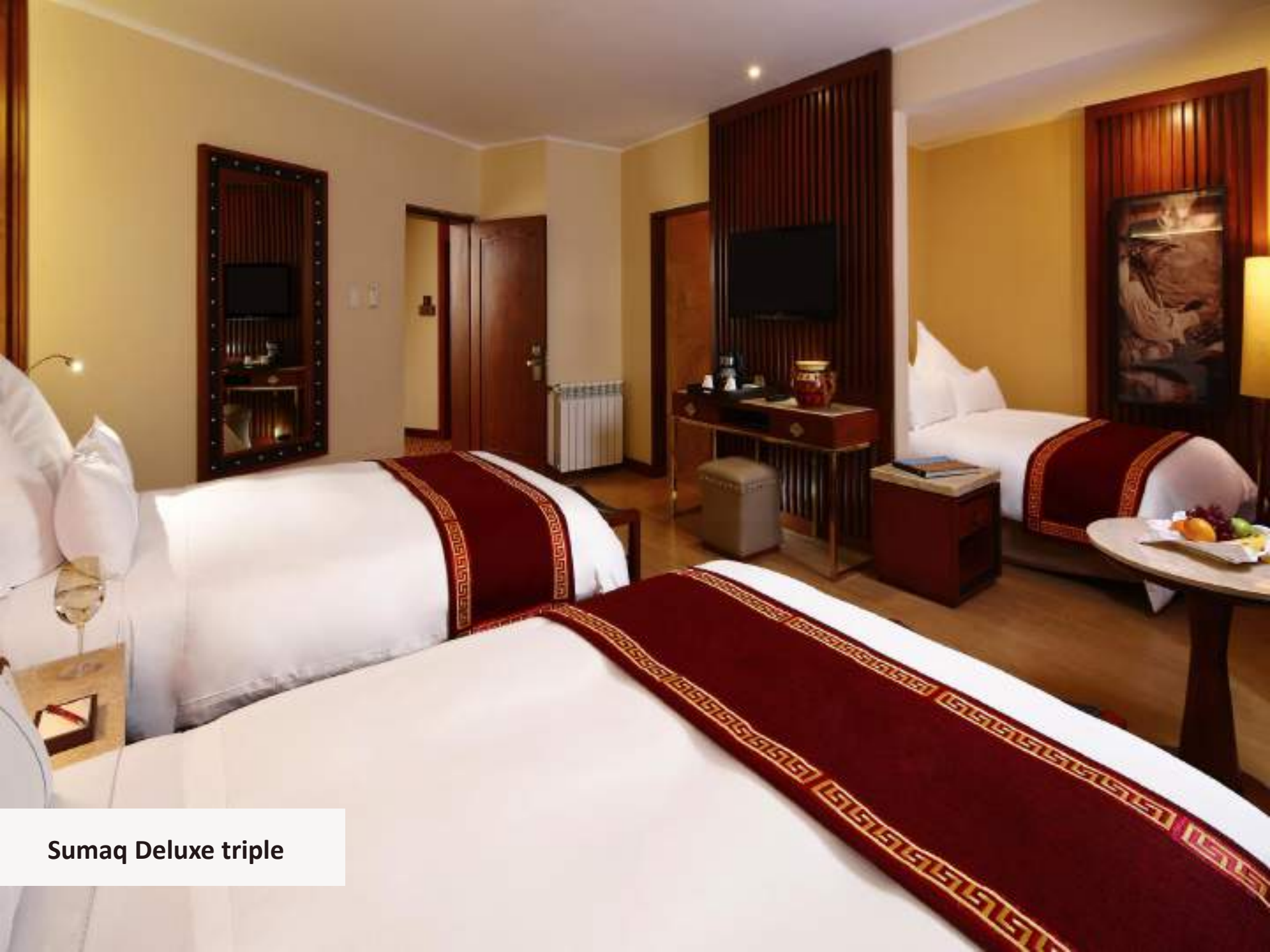
Sumaq Deluxe triple