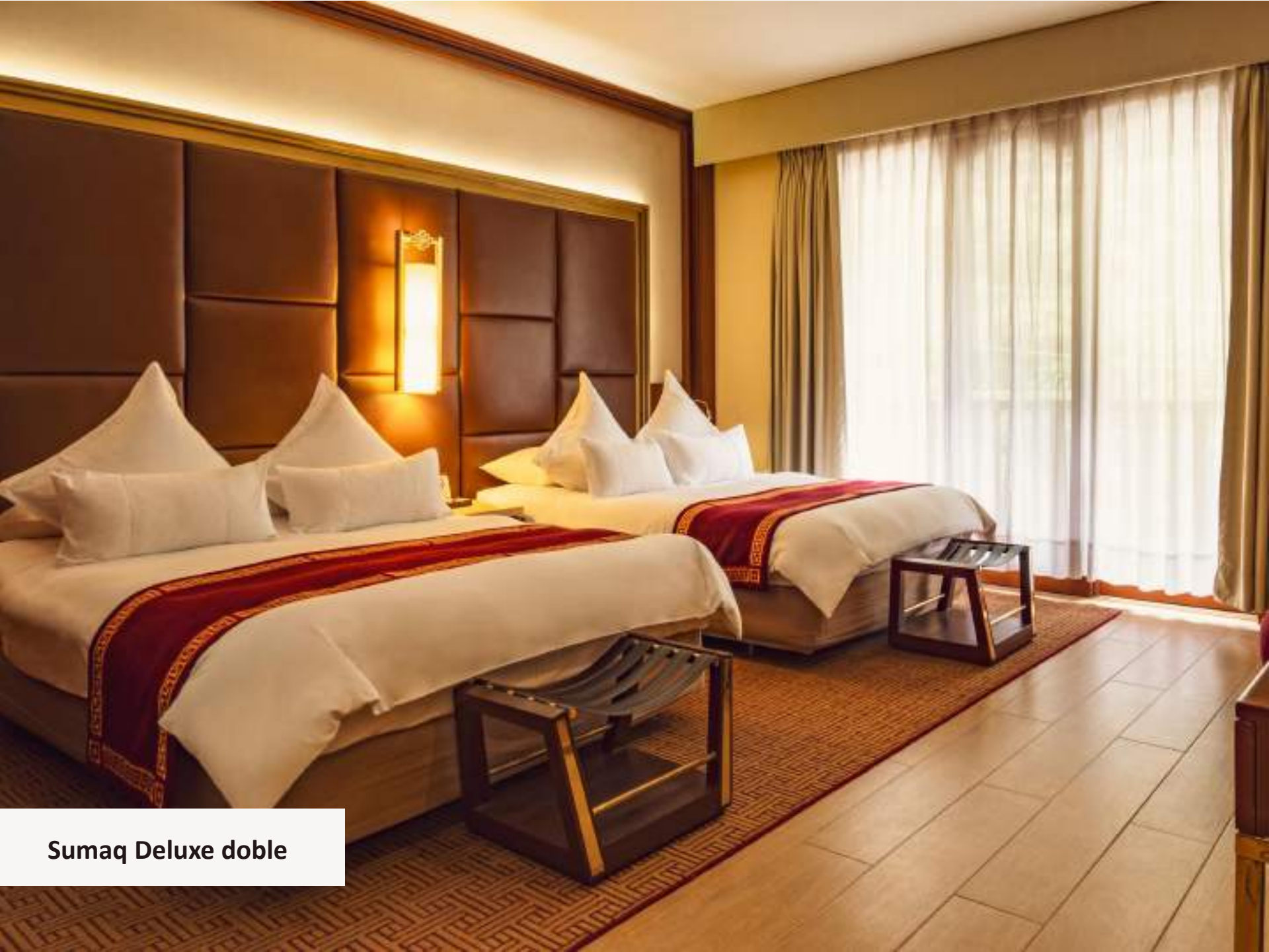
Sumaq Deluxe doble