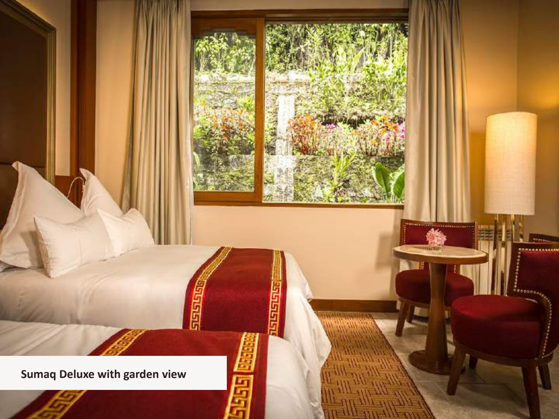
Sumaq Deluxe with garden view