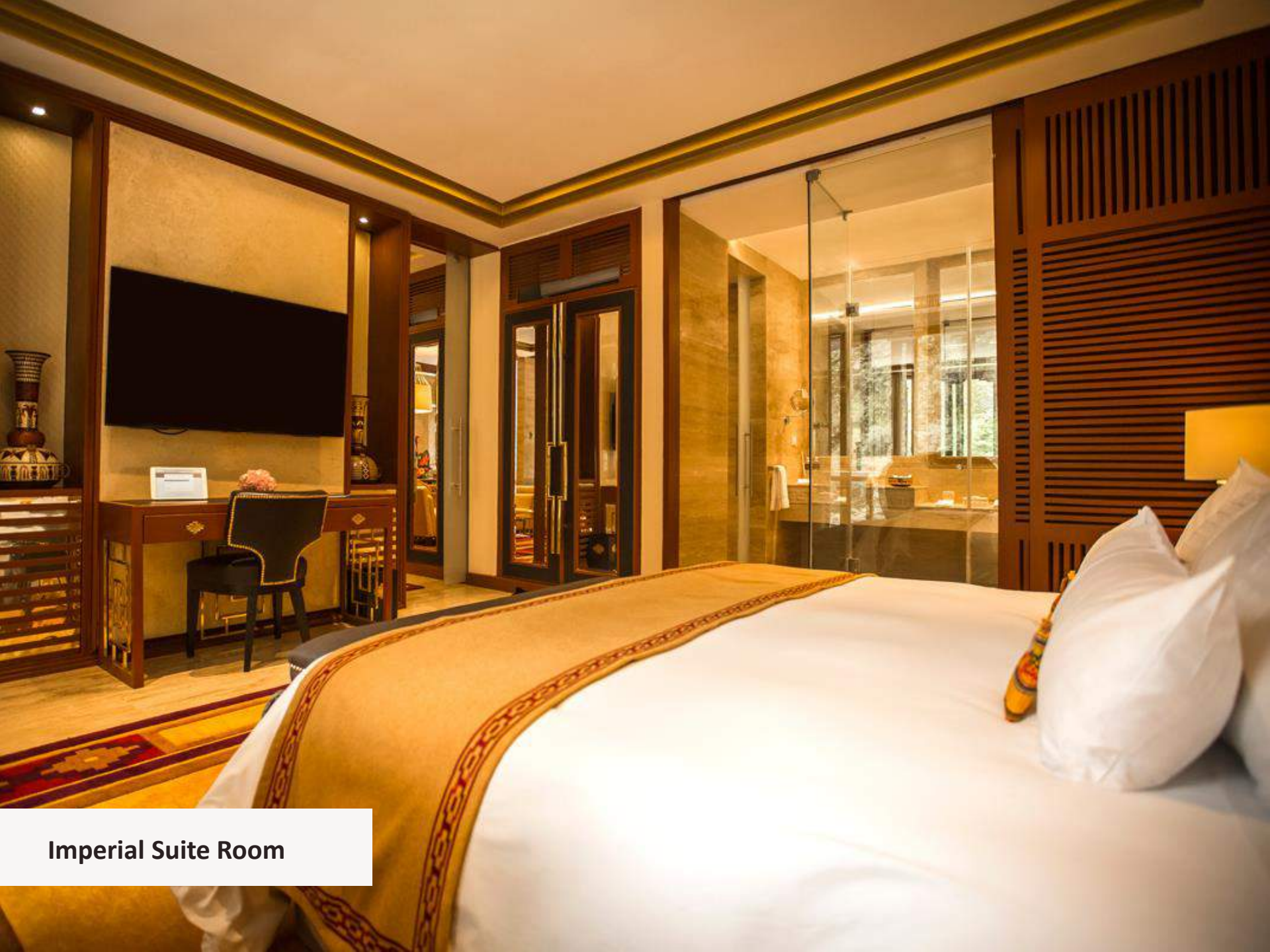
Imperial Suite Room