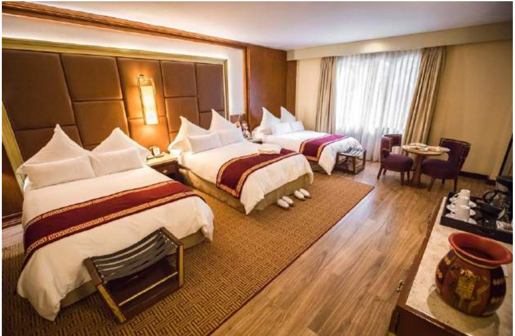
Sumaq Deluxe family Room

4 comfortable full-size bed. Ideal for 8 people: 4 adults and 4 children.