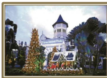
Christmas display in 1997