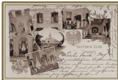
An old postcard featuring the Teutonia Club