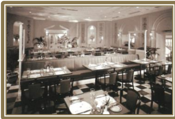
Coffee Lounge in 1977