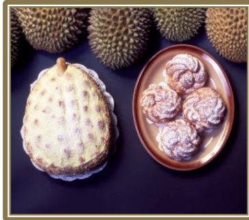
Durian Fiesta's D24 Durian Puffs