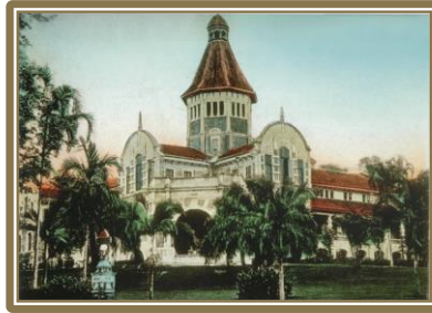
Teutonia Clubhouse in the 1900s