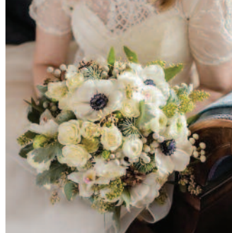
THE FLOWERSHOP KOONS FLORIST 46 PRINCE STREET | LITTLESTOWN, PA 17340

717-359-4824 | 800-206-9367 | flowershopkoons@yahoo.com flowershopkoons.com