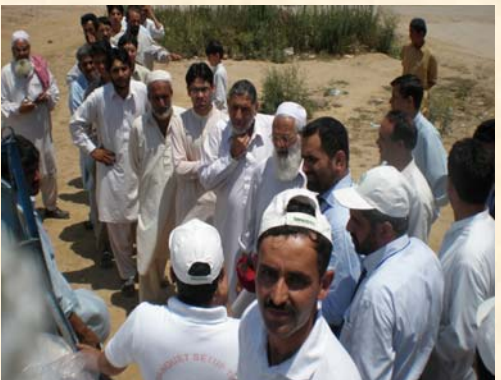
The situation in Swat is an eye opener for us not as a part of Serena but also as a nation and we should take initiatives like this to make them feel that they are one of our own and to support them when they need us the most.