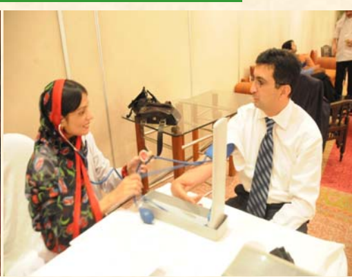
The camp was organized with the objective to improve the quality of life of the Thalassaemics and at the same time to continue our efforts towards eradication of Thalassaemia from our society. This camp was joint efforts of all departments of ISH, management of SOC, SOC tenants' and the Foundation itself.