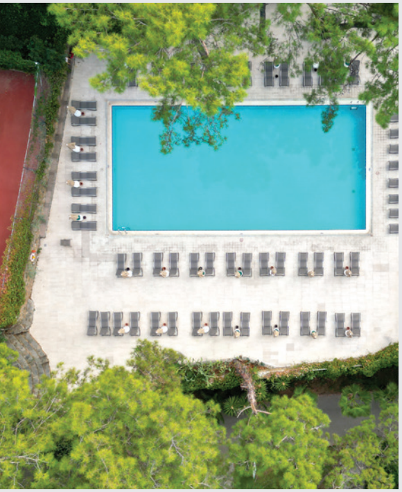
Relax Pool: Located among the pine trees in the forest area. Only the "sound of nature" can be heard.