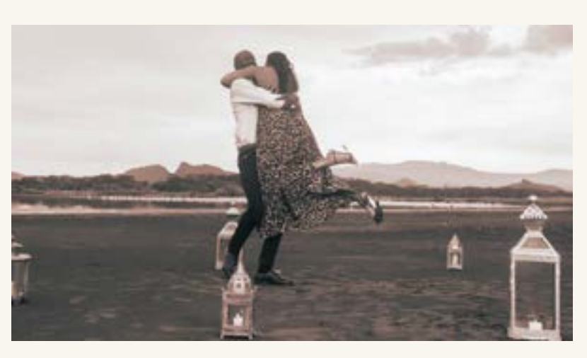
The Diamond Lakeside Weekend

Includes: two nights' accommodation in our Flamingo Suite which will be supplied with red roses, chilled wine and chocolates. Note: the bar can be equipped with the drinks of your choice.