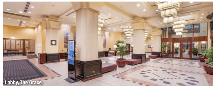
Lobby, The Grace