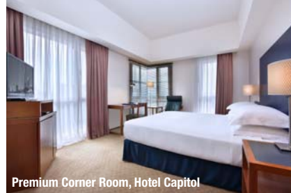
Premium Corner Room, Hotel Capitol