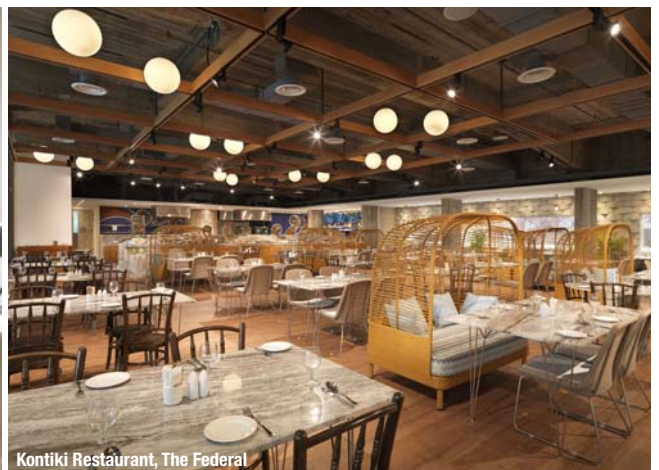
Kontiki Restaurant, The Federal