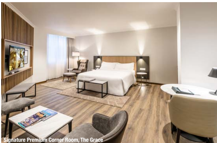
Signature Premium Corner Room, The Grace

Whether you are traveling, for business or pleasure, you will enjoy warm hospitality, excellent facilities, strategic locations - that's the FHI promise.