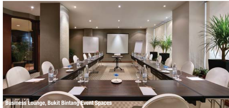
Business Lounge, Bukit Bintang Event Spaces

Amadeus: SYDFOC Galileo: 82925 Sabre: 11679 Worldspan: SYDHB