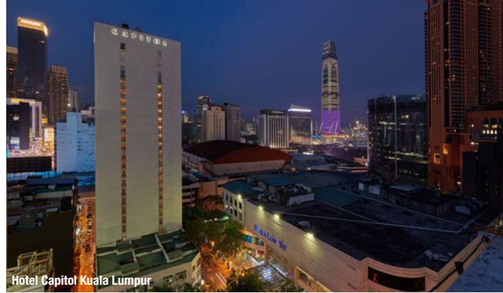
Hotel Capitol Kuala Lumpur

Amadeus: KULCHL Galileo: 6604 Sabre: 46088 Worldspan: 80091