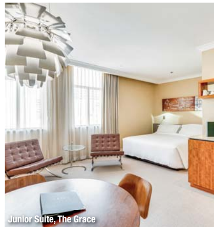
Junior Suite, The Grace