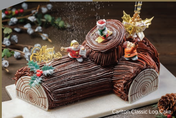
Carlton Classic Log Cake