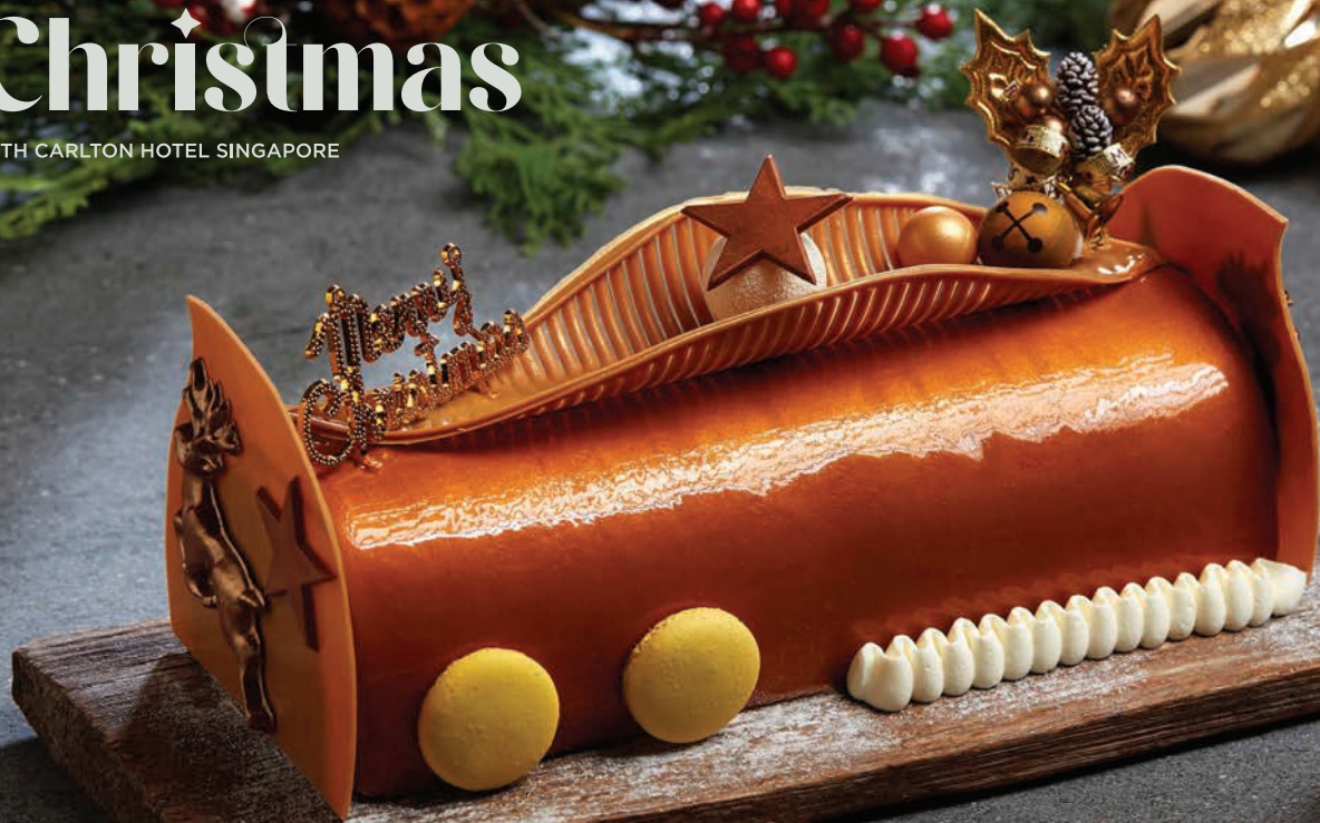
Golden Bird's Nest Yule Log