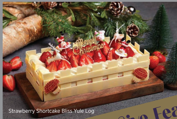
Strawberry Shortcake Bliss Yule Log