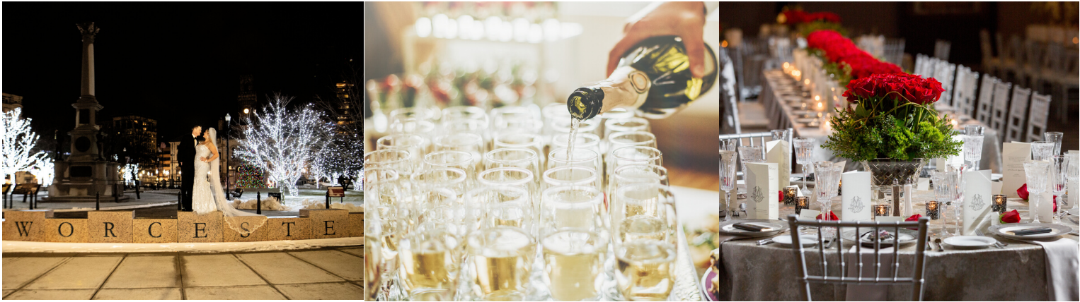
All Menu Prices are Exclusive of a 15% Service Charge, 7% Taxable Administrative Fee & 7% Tax