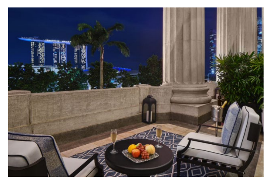
Each loft suite features a magnificent verandah that offers panoramic views of Marina Bay

living room, double-height French doors open up to a magnificent verandah flanked by 20-foot Doric columns on either side, offering panoramic views of Marina Bay.