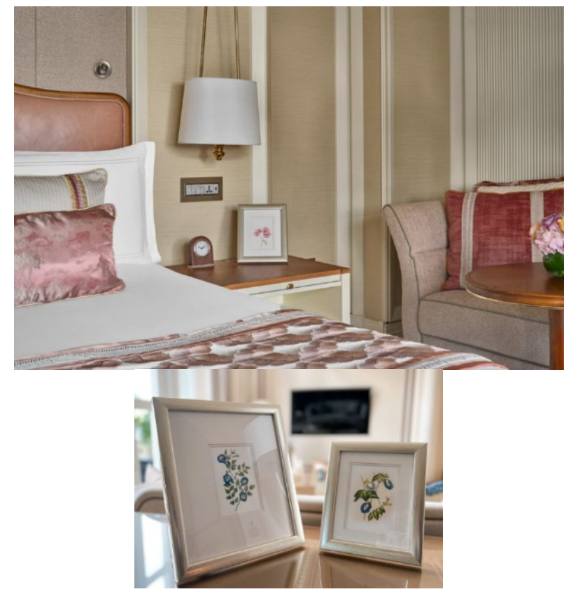
Floral accents are incorporated throughout the suites through botanical illustrations, celadon vases and other themed accessories

A taste of Singapore's past is injected into each suite through a specially curated selection of photographic prints by Singaporean architectural and heritage photographer Marjorie Doggett, offering guests a nostalgic visual display of the cityscape in the 1950s.